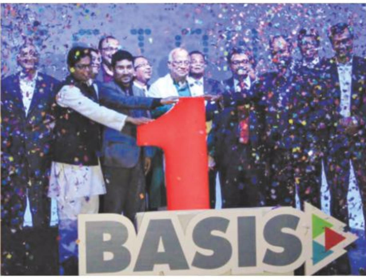
Finance Minister AMA Muhith inaugurates BASIS's One Bangladesh Campaign, Radisson hotel in Dhaka yesterday.