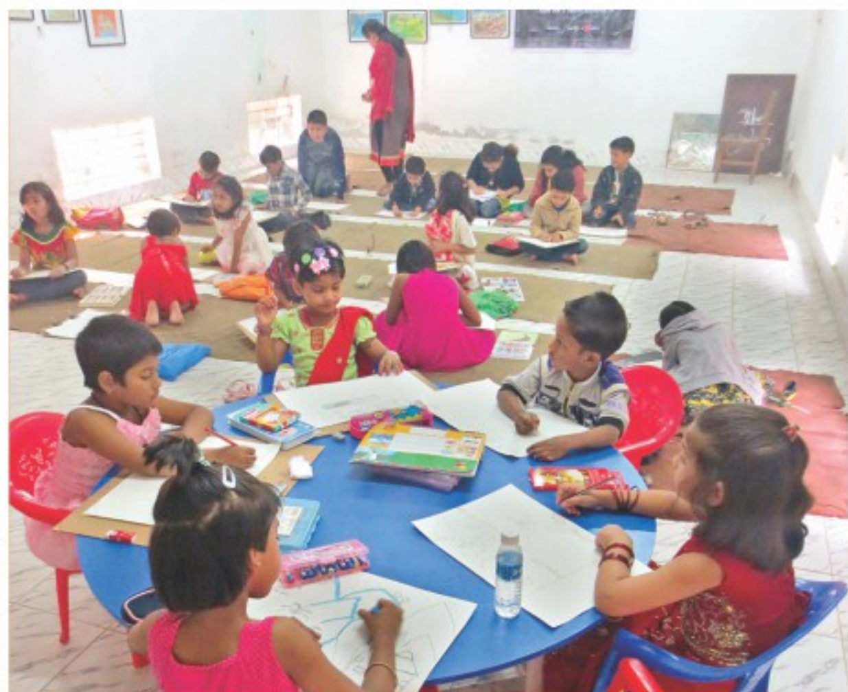
Children participate in the drawing competition.