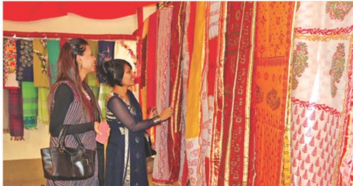
Visitors check out the fabrics and designs at the festival.

Following the discussion, the minister visited the stalls where young fashion designers showcased their latest designs.