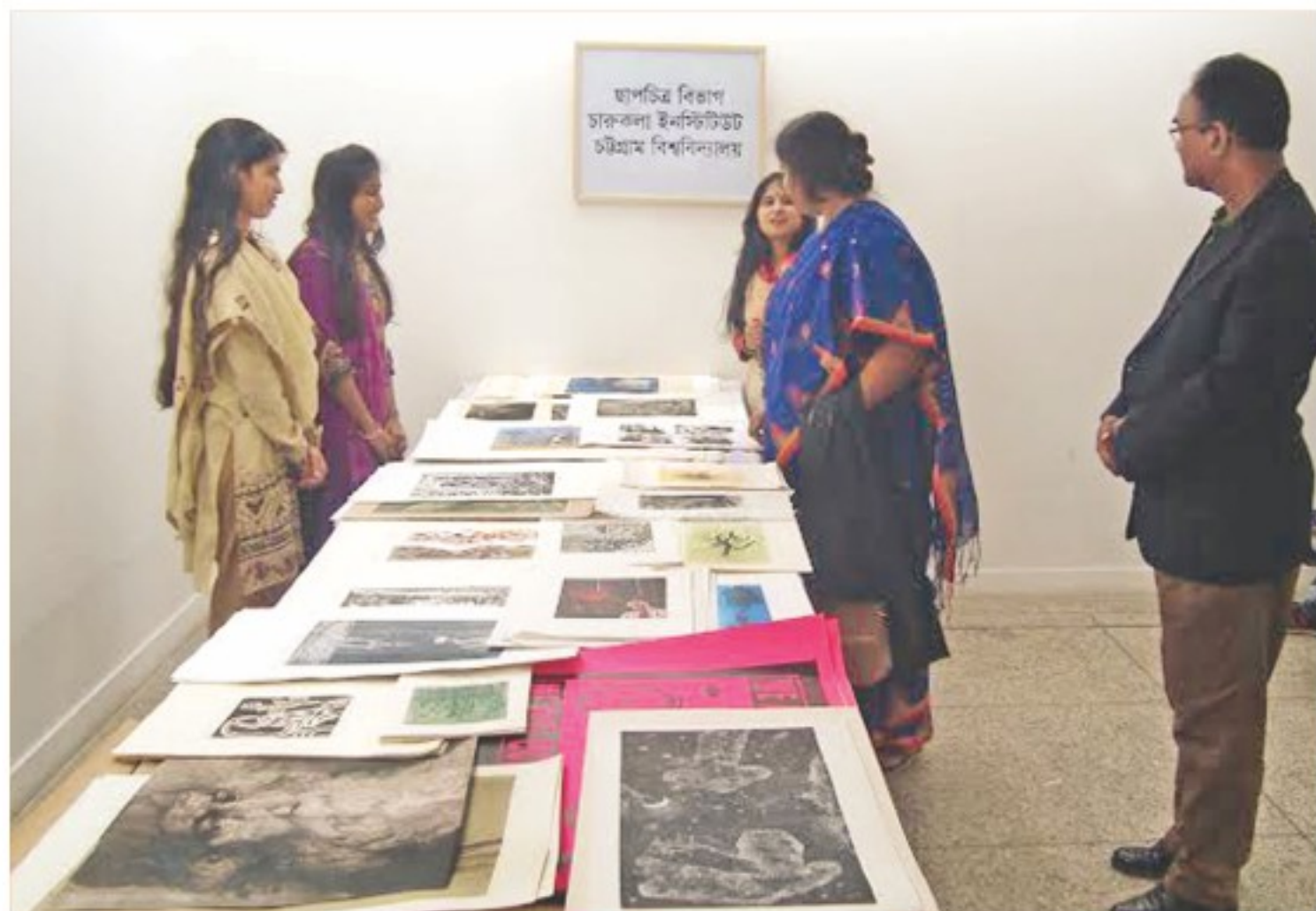
Prints on display at the fair.

Printmaking Department, Faculty of Fine Arts (FFA), University of Dhaka; Printmaking Department, Institute of Fine Arts, Chittagong University;