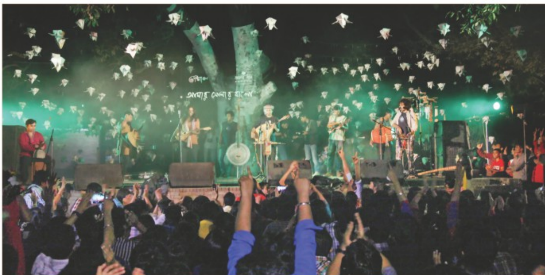
Joler Gaan doing what they do best.

Even before the scheduled start time, the