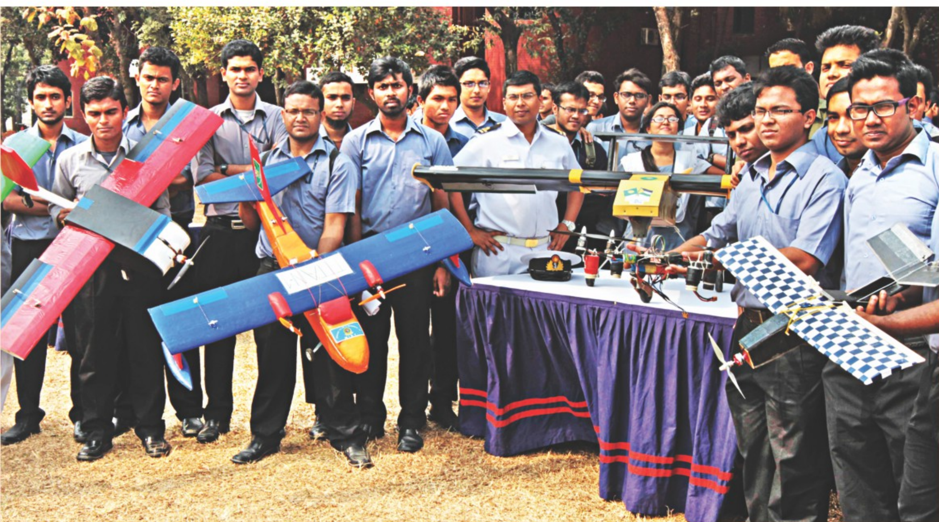
Students of Aeronautical Engineering department of Military Institute of Science and Technology pose with their prototype UAVs on their Mirpur Cantonment campus yesterday. Two of the unmanned planes, the one on the right and the second from left, are heading for competition in the US this year. Bottom , a prototype quadcopter.