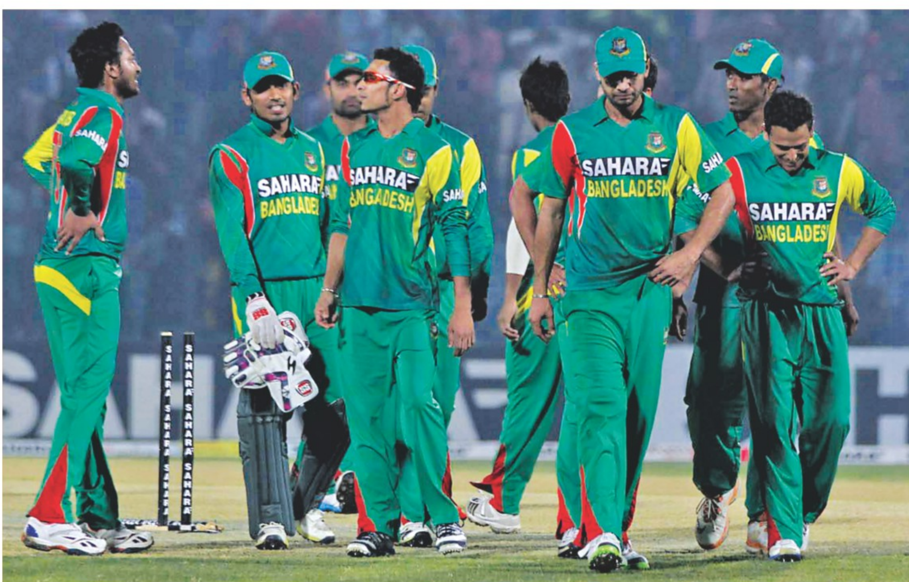
LAST-BALL BLUES ... A dejected Bangladesh side make their way out of the field after losing the second and final T20I by three wickets against Sri Lanka at the Zohur Ahmed Chowdhury Stadium in Chittagong yesterday. Story on page 14.