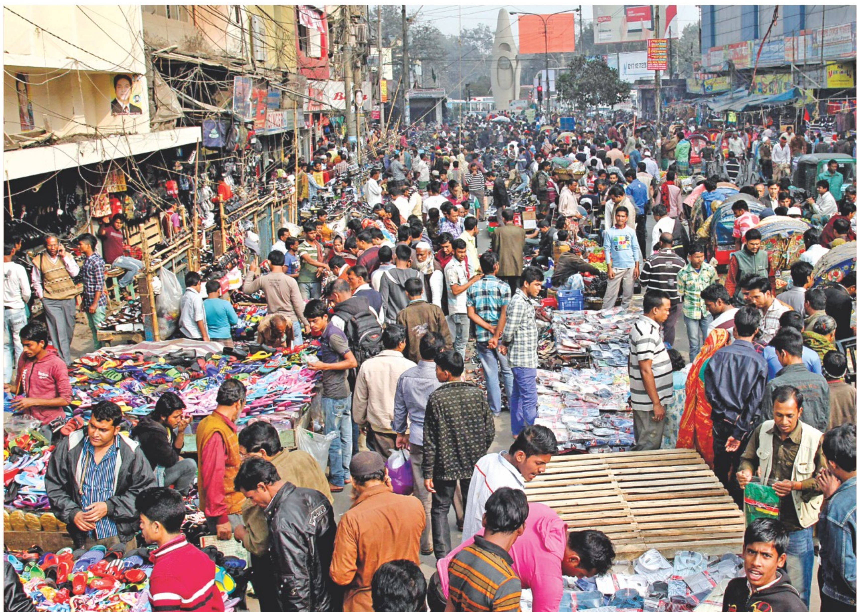
The entire street between Golapshah Mazar and Bangabandhu Square in Gulistan is taken over by hawkers. It has been this way for years and locals allege that hawkers affiliated with the ruling party, whichever it may be, occupy the key street in an area plagued by congestion.

Total cost $2.56b | Current reserve $18b