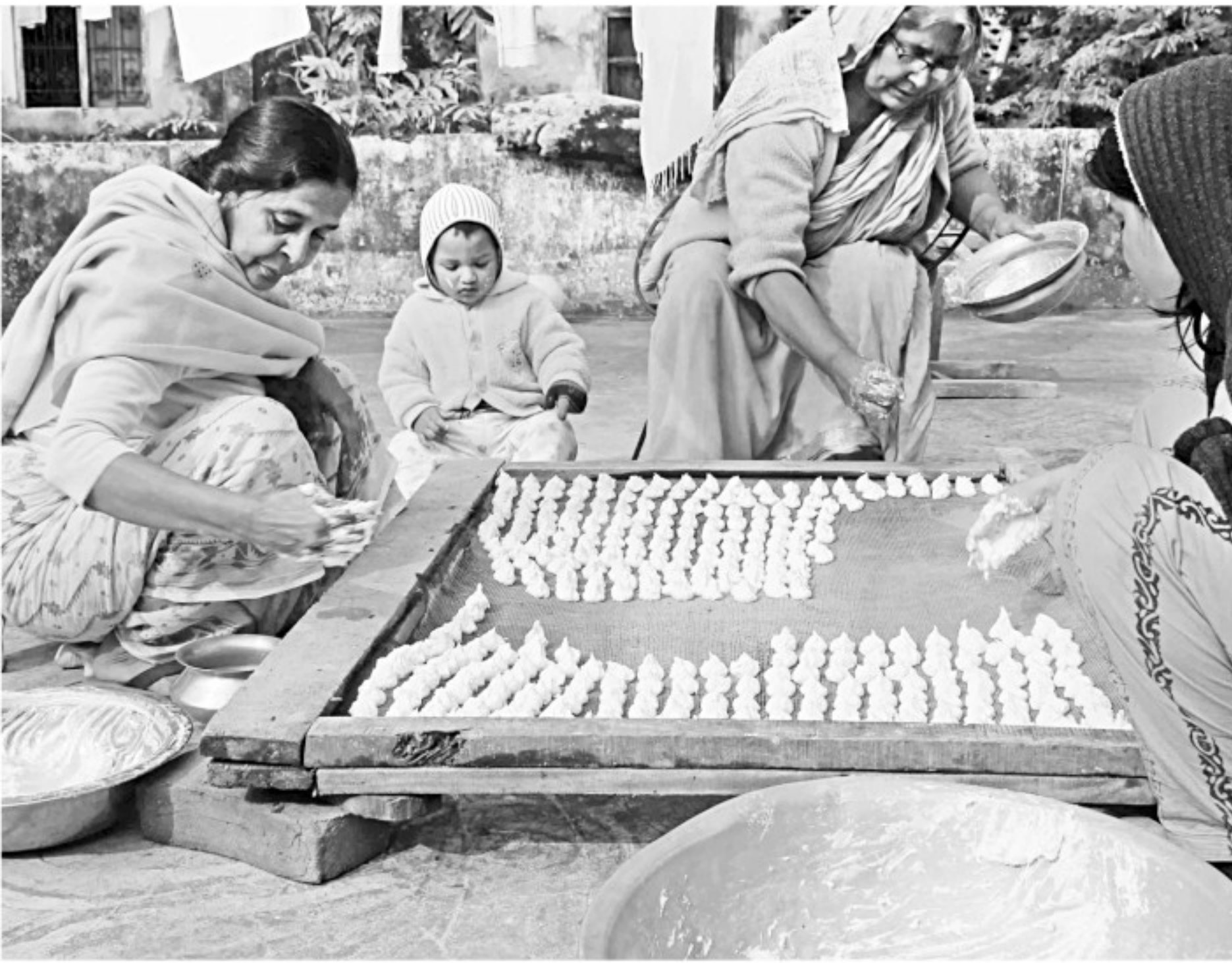
Two elderly women preparing bori , a popular food item made of gourd and pulse, on the roof of a house to dry them in the sun, in Jhenidah town.