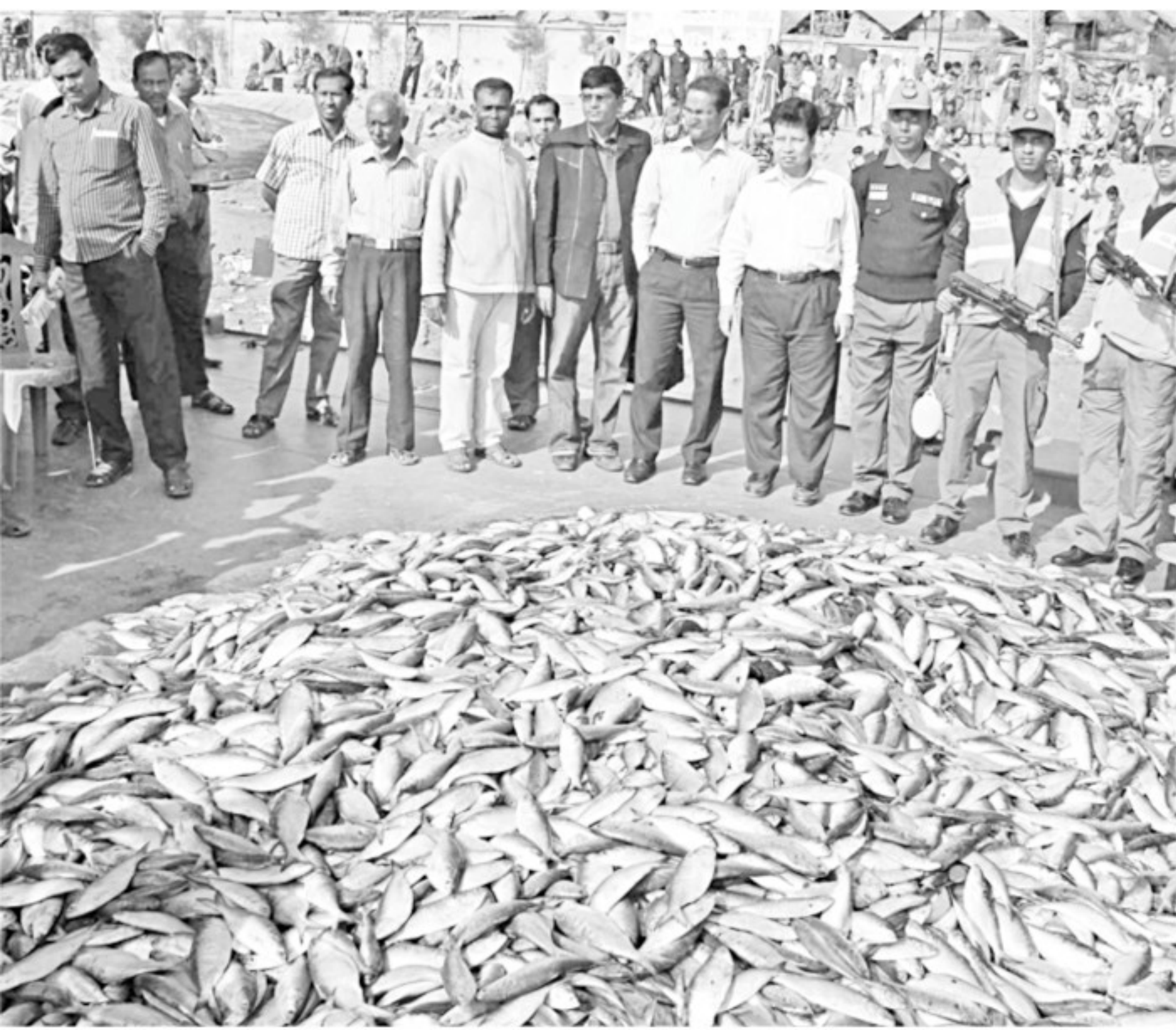
PHOTO: STAR Coastguards and staff of the fisheries department seize huge quantity of jatka (hilsa fry less than 10 inches in length) from two trawlers on the Kirtonkhola River in Barisal early yesterday.