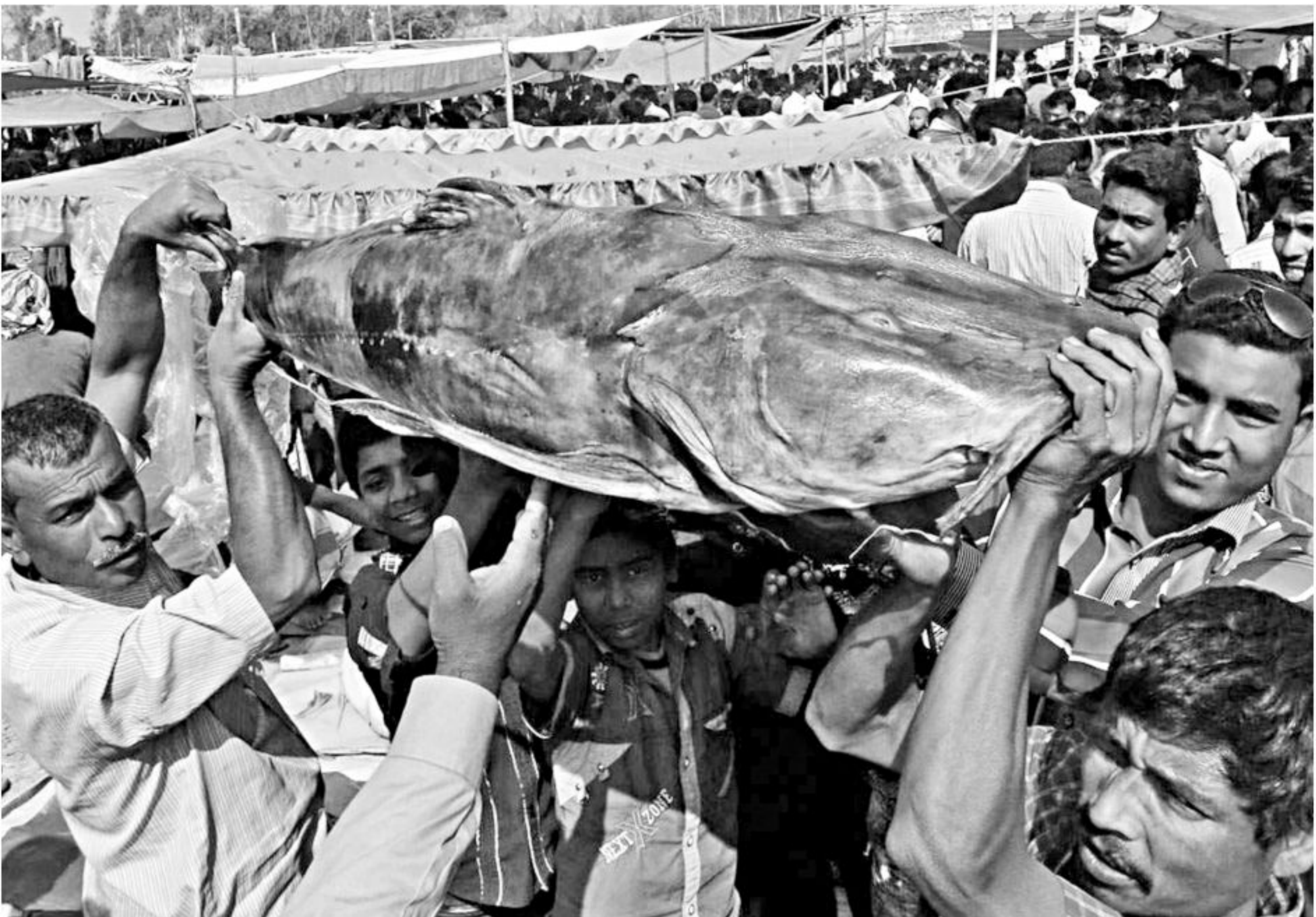
A big bagha aieer, a delicious fish weighing around 80 kg, being taken to Poradaha Mela, the 150-year-old traditional fair, opened at Golabari under Gabtoli upazila of Bogra yesterday. The fair is followed by another festival known as Bou Mela in the area.