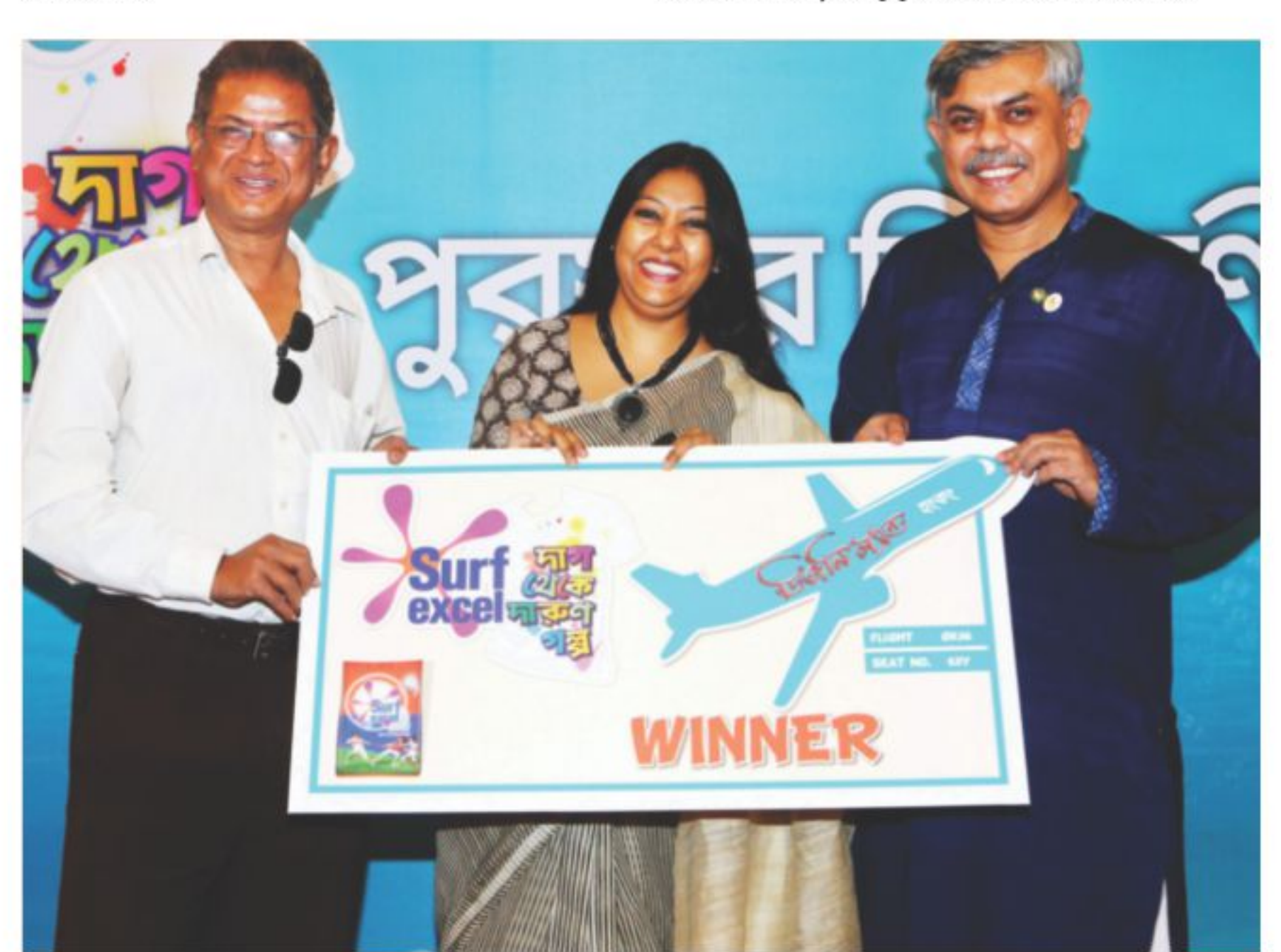
Ahsan Habib (L) and Anisul Haque with the awardee (C).