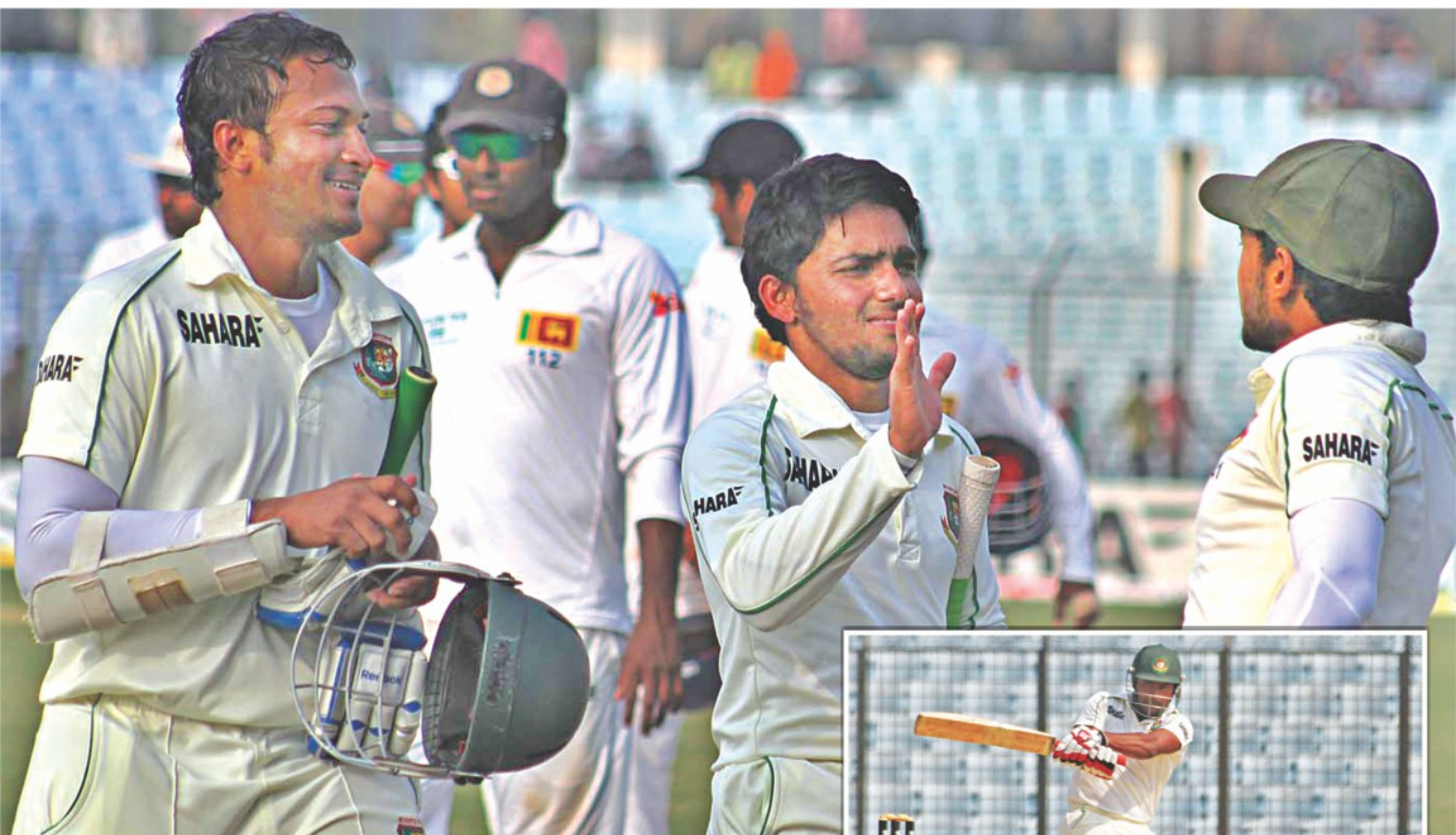
JOB WELL DONE! Captain Mushfiqur Rahim (R) greets star batsman Mominul Haque after the latter and Shakib Al Hasan took Bangladesh to safety on the fifth and final day of the second Test against Sri Lanka at Chittagong yesterday where the top order, including Imrul Kayes (inset), helped the cause with responsible contributions.