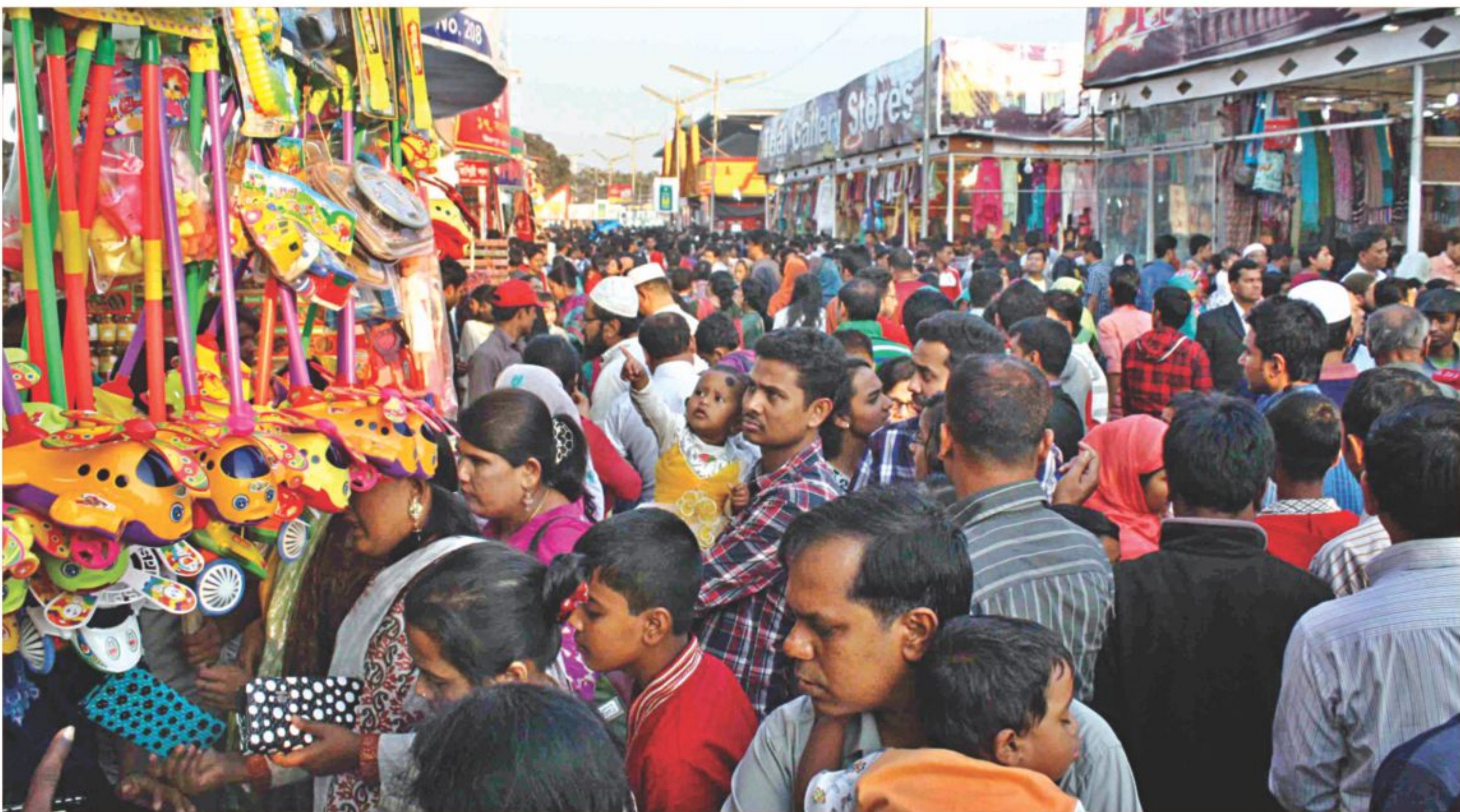
A large number of people throng the Dhaka International Trade Fair 2014 yesterday taking the opportunity of it being the weekend.

STAFF CORRESPONDENT The government will not go for open-pit coal mining for now as it plans to rely on imported coal for producing electricity. "We have moved away from the decision to extract coal through open-pit mining method," said Nasrul Hamid, state minister for power, energy and mineral resources. The state minister told the BBC yesterday that the government was not going to destroy farmland to get coal through open-pit mining and that it was leaving energy resource for future generations. Bangladesh is yet to use its coal reserves on large scale because of the indecision over the method of coal extraction, as environmentalists are strongly opposed to the idea of the open-pit extraction. The state minister said coal would account for more than half of the major power plants to be set up in the coming years. SEE PAGE 11 COL 3