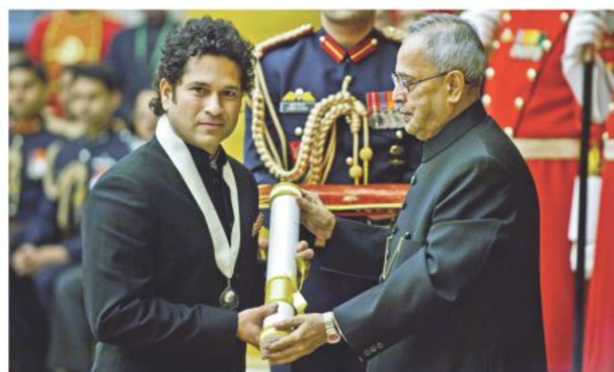
Sachin Tendulkar receiving the Bharat Ratna award from Indian president Pranab Mukherjee in New Delhi on Tuesday.