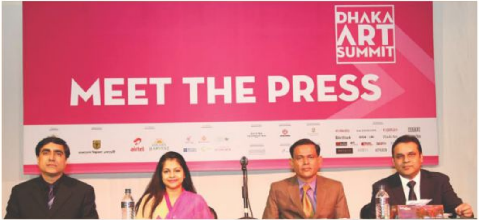
Speakers at the press conference.

A range of group exhibitions will include--- Liberty (title of the exhibition), Bangladeshi modern and