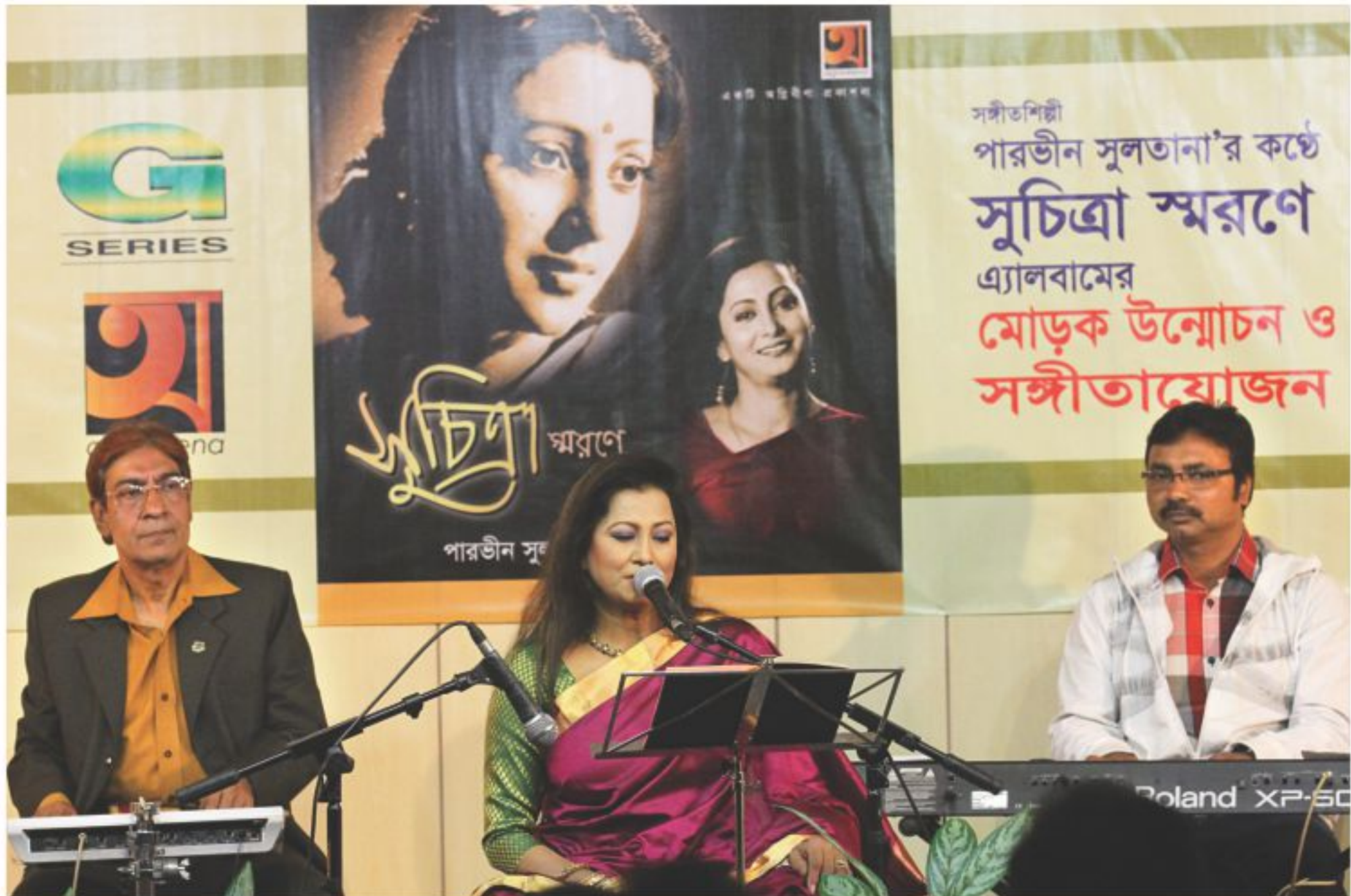
The artiste immersed in melody while performing the timeless numbers.

Agnivee has published the album. The albums contain 13 songs including, "Ghum Ghum Chand", "E Shudhu Gaan-er Din", "Gaan-e Mor Kon Indradhonu", "Ei