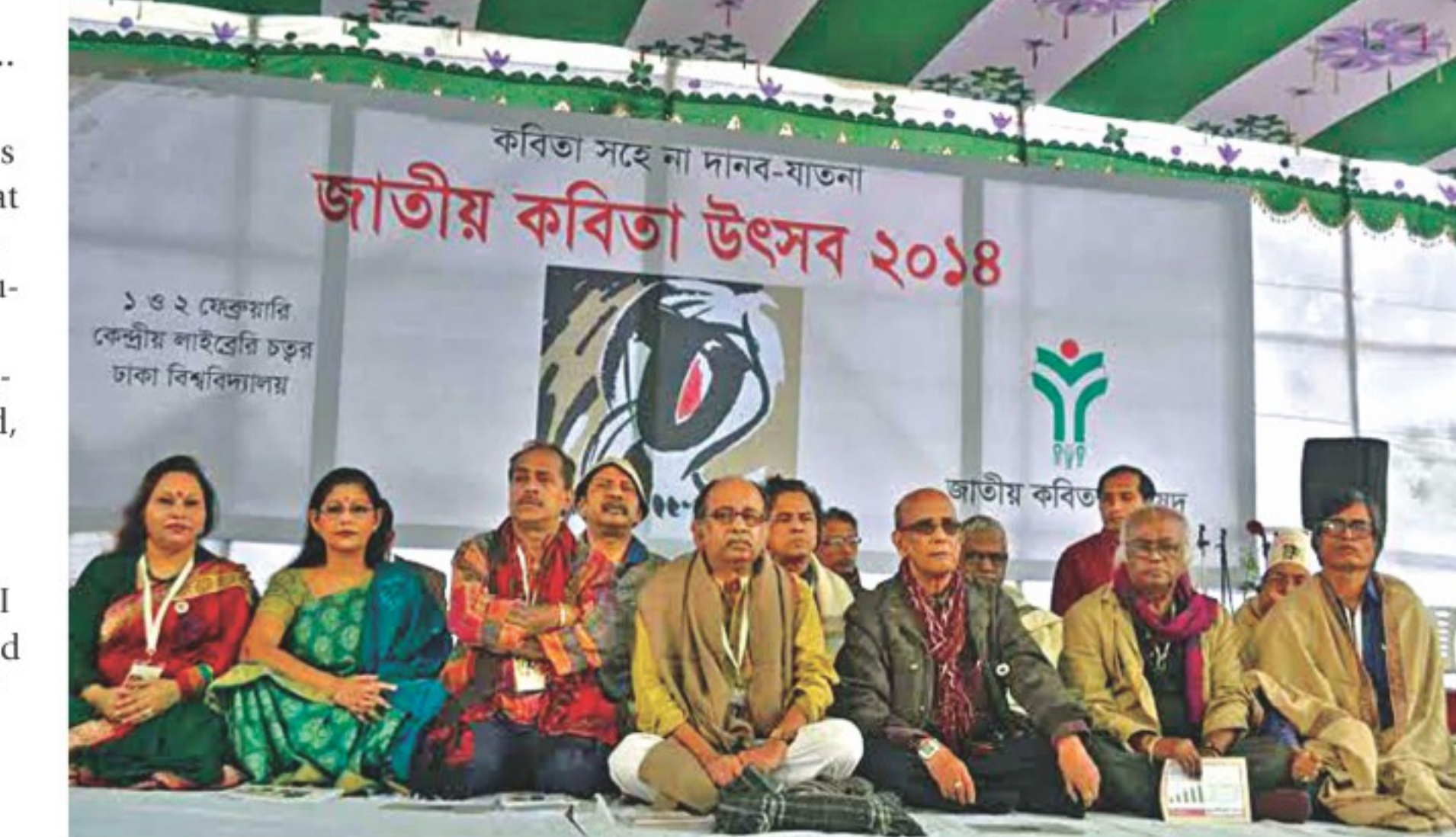
Noted bards at the inauguration.