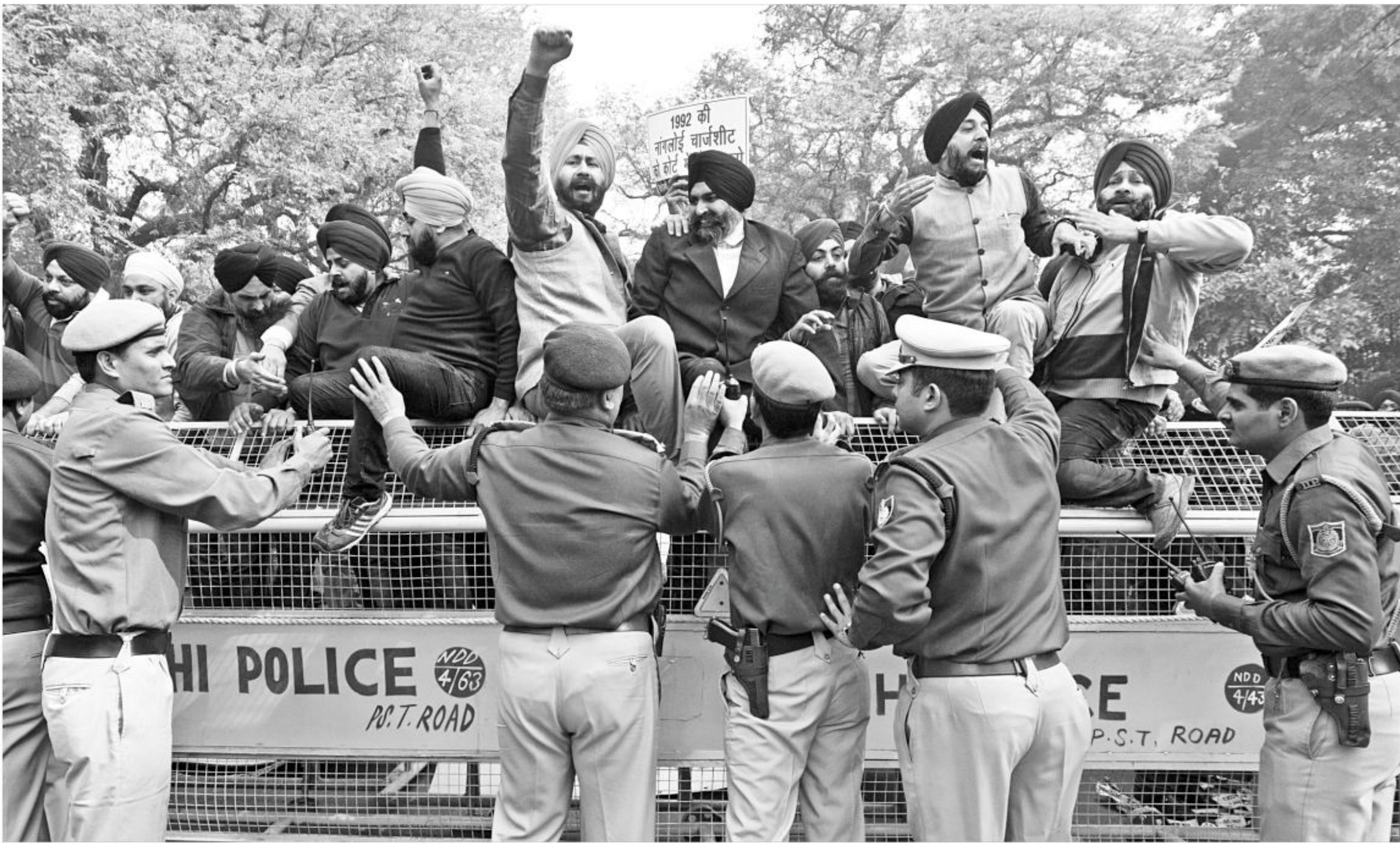
Activist of Shiromani Akali Dal (Badal) shout slogans against Congress Vice President Rahul Gandhi during a protest outside Congress Party headquarters in New Delhi, yesterday. Sikh groups staged the protest, stating that a mere apology on the 1984 riots will not suffice and demanded that accused culprits should get the toughest of the punishment.

In a setback to Pervez Musharraf, Pakistan's Supreme Court yesterday dismissed his petition seeking a review of its verdict that declared as unconstitutional the 2007 emergency imposed by the embattled former dictator. A 14-judge bench, headed by Chief Justice Tassaduq Hussain Jilani, said the time period for filing an appeal has lapsed. It further said the review petition was not maintainable as it did not fulfil the criteria of merit. The bench said arguments presented by 70-year-old Musharraf were irrelevant to the case. In an order issued in July 2009, the apex court had declared the emergency proclaimed by Musharraf in November 2007 as unconstitutional. On December 23 last year, Musharraf filed a petition after a delay of over four years seeking a review of the apex court's verdict. The petition stated Musharraf was facing trial in a special court on charges of high treason on the basis of the apex court's July 2009 order.