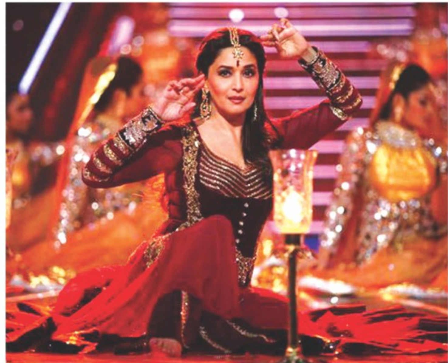
(Clockwise) Madhuri performs at the ceremony; Farhan and Deepika took home the Best Actor awards.

If there was any fear that India's sporting legends have been forgotten, the 59th Idea Filmfare Awards 2013 demolished that notion. "Bhaag Milkha Bhaag", the commendably realistic biopic of sprint champion Milkha Singh, scored three out of the top four awards -- best actor, best director and best film. The picture won a total of six prizes. The star-studded awards ceremony was held at YashRaj Studio in Andheri on Friday. Farhan Akhtar shook off other nominees in the race for best actor while Rakeysh Omprakash Mehra gained winning position as best director. Deepika Padukone, who was expected to win best actress given she had two nominations, won for "Goliyon Ki Raasleela, Ramleela". Leading the list of nominations were films that pleased the box office in 2013. "Chennai Express" shared space with "Yeh Jawaani Hai Deewani", "Ramleela" and "Ranjhanaa". The jury also acknowledged the popularity of "Kai Po Che", "Aashiqui 2", "Lootera", "Krrish 3" and "The Lunchbox". Dhanush, whose performance