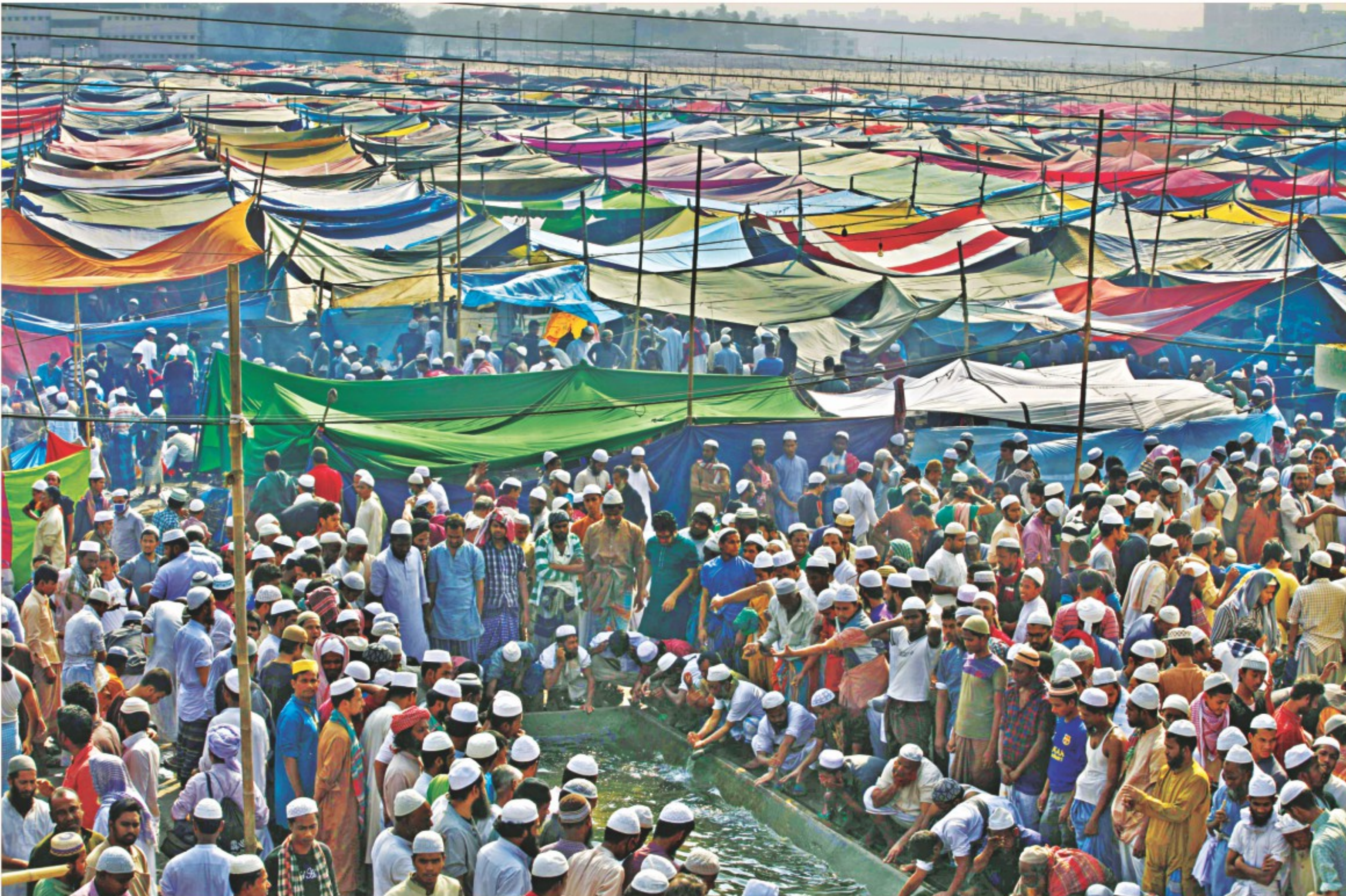
Devotees gather at a reservoir at the Biswa Ijtima ground for ablutions before Zohr prayers yesterday, the second day of the first part of the Ijtima on the Turag in Tongi. The Akheri Munajat (final prayers) will be held today seeking divine blessings of Almighty Allah.