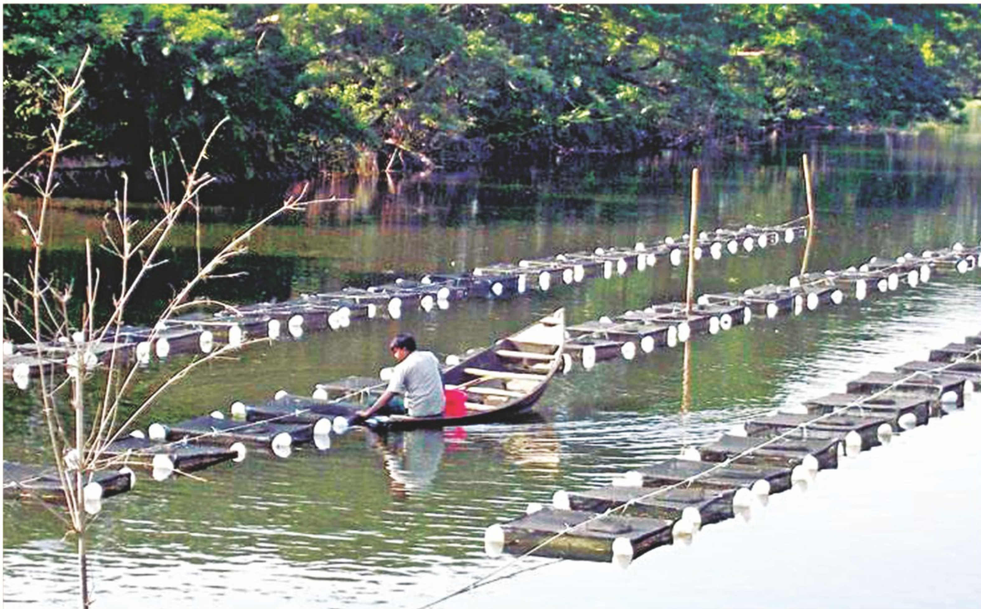
A fish farmer tends his fish inside small cages dipped in Neyamatpur canal of Kalapara upazila in Patuakhali. Several fish farmers have been able to stand on their own feet using this method of farming in closed off canals and water bodies.