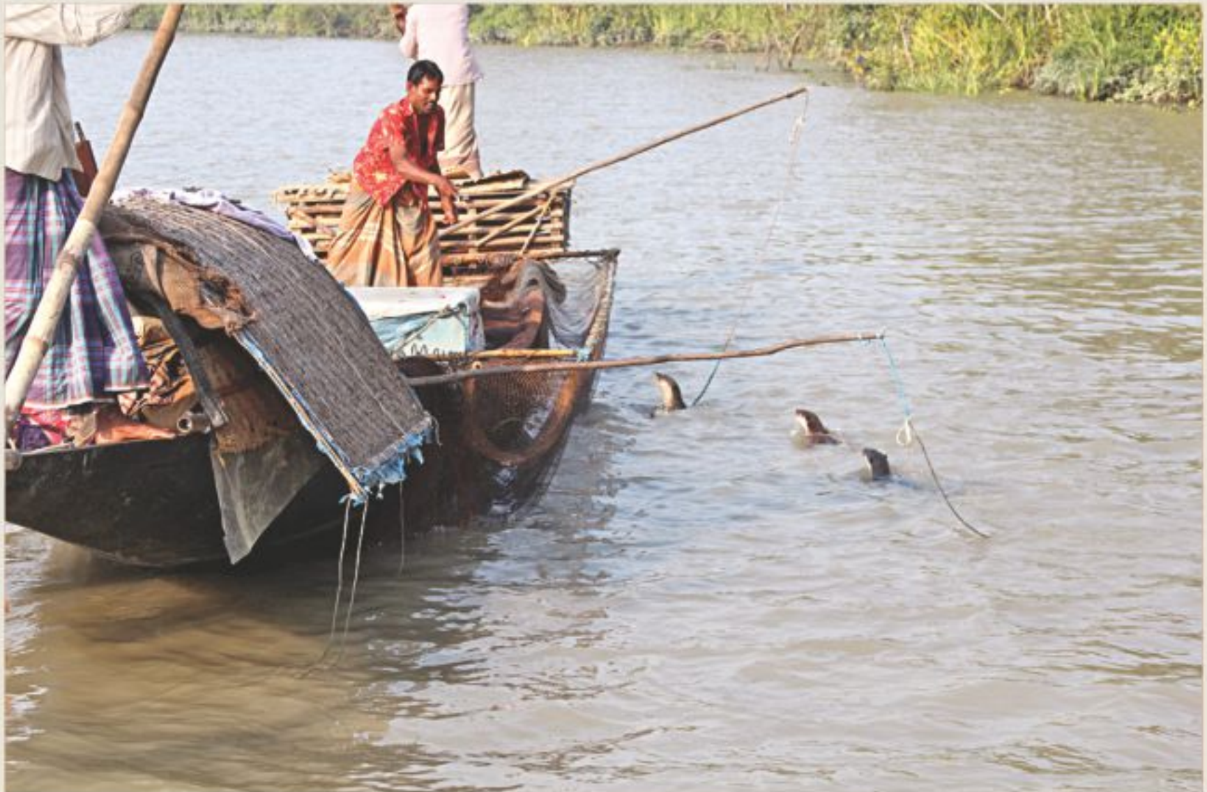
Fishing with smooth-coated otters.