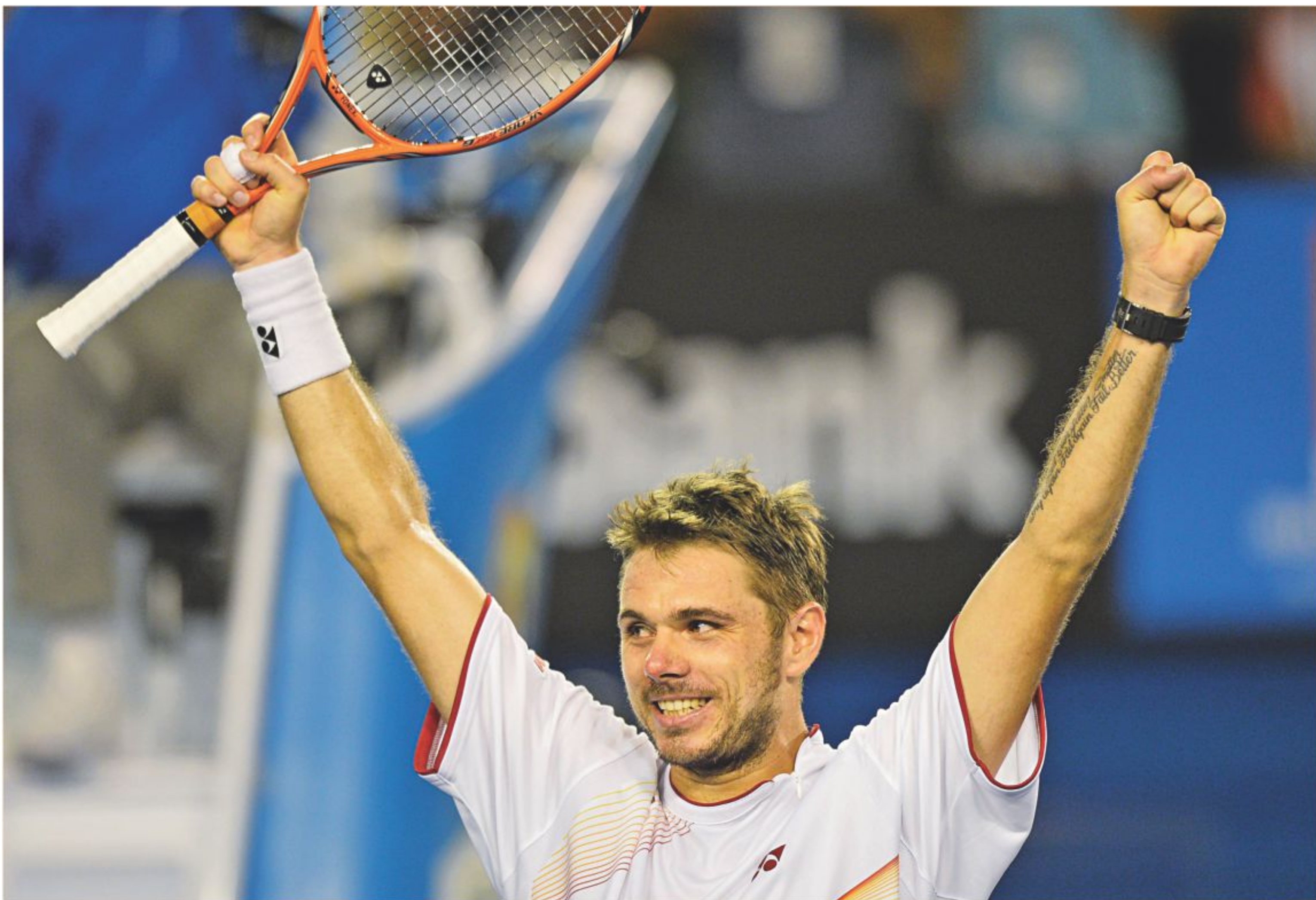
Stanislas Wawrinka of Switzerland celebrates his semifinal victory over Tomas Berdych of the Czech Republic at the Australian Open in Melbourne yesterday.

Wawrinka didn't lose serve and only had one break point against him as big-serving Berdych dished up seven double faults, four of them, crucially, in the third and fourth set