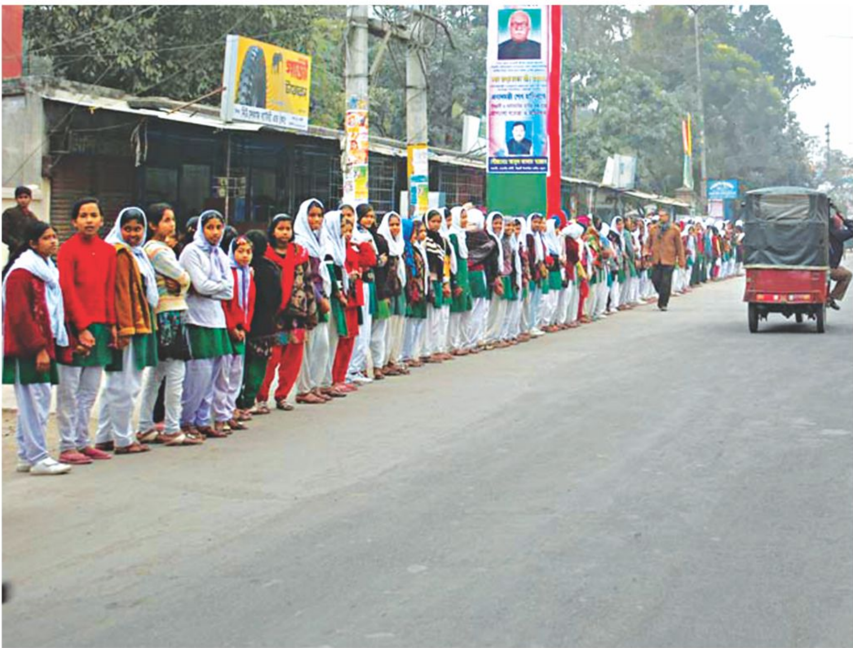
Students kept standing along the Ishwardi highway in Pabna for an agonising three and a half hours yesterday just to welcome Land Minister Samsur Rahman Sarif Dilu. As many as 140 educational institutions in Ishwardi remained closed on the day. Bottom right, around 3,000 motorbikes escort the minister to the district.