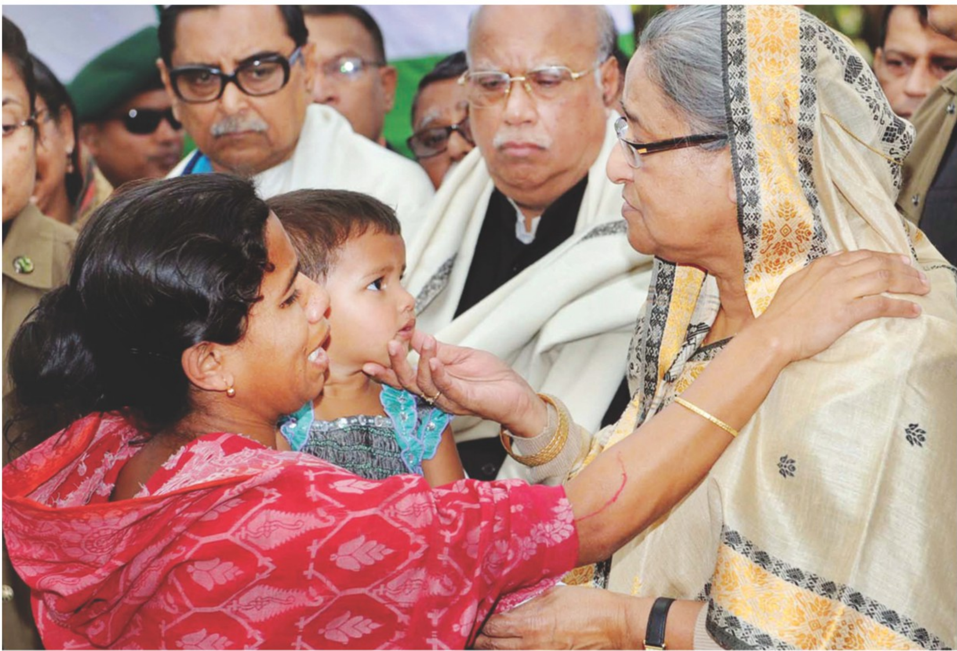
Prime Minister Sheikh Hasina affectionately touches a child's chin at Satkhira circuit house yesterday when the family devastated by recent attacks on the Hindus in the district went there to meet her and receive financial aid.