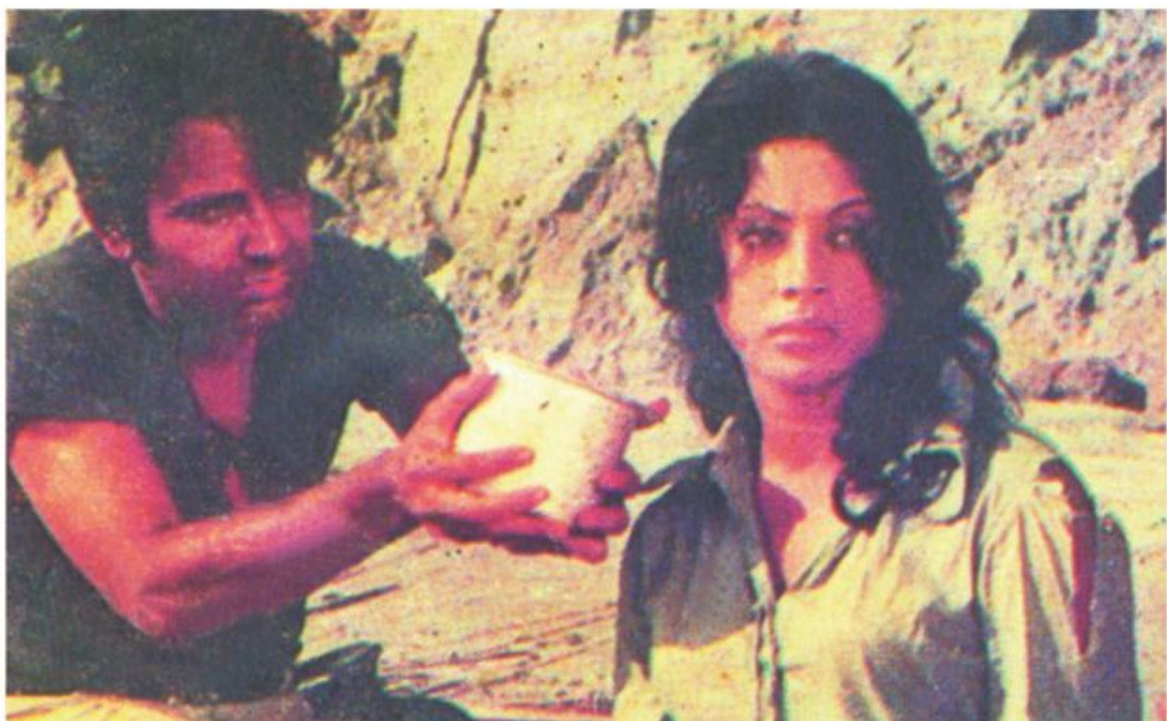
A scene from Kabir' "Shimana Periya".

Alamgir was born in Rangamati in 1938. He completed matriculation from Dhaka Collegiate School in 1952 and intermediate from Dhaka College in 1954. After completion of bachelor's degree from the Dhaka University in physics, he went to England to study electrical engineering at Oxford University. It is during