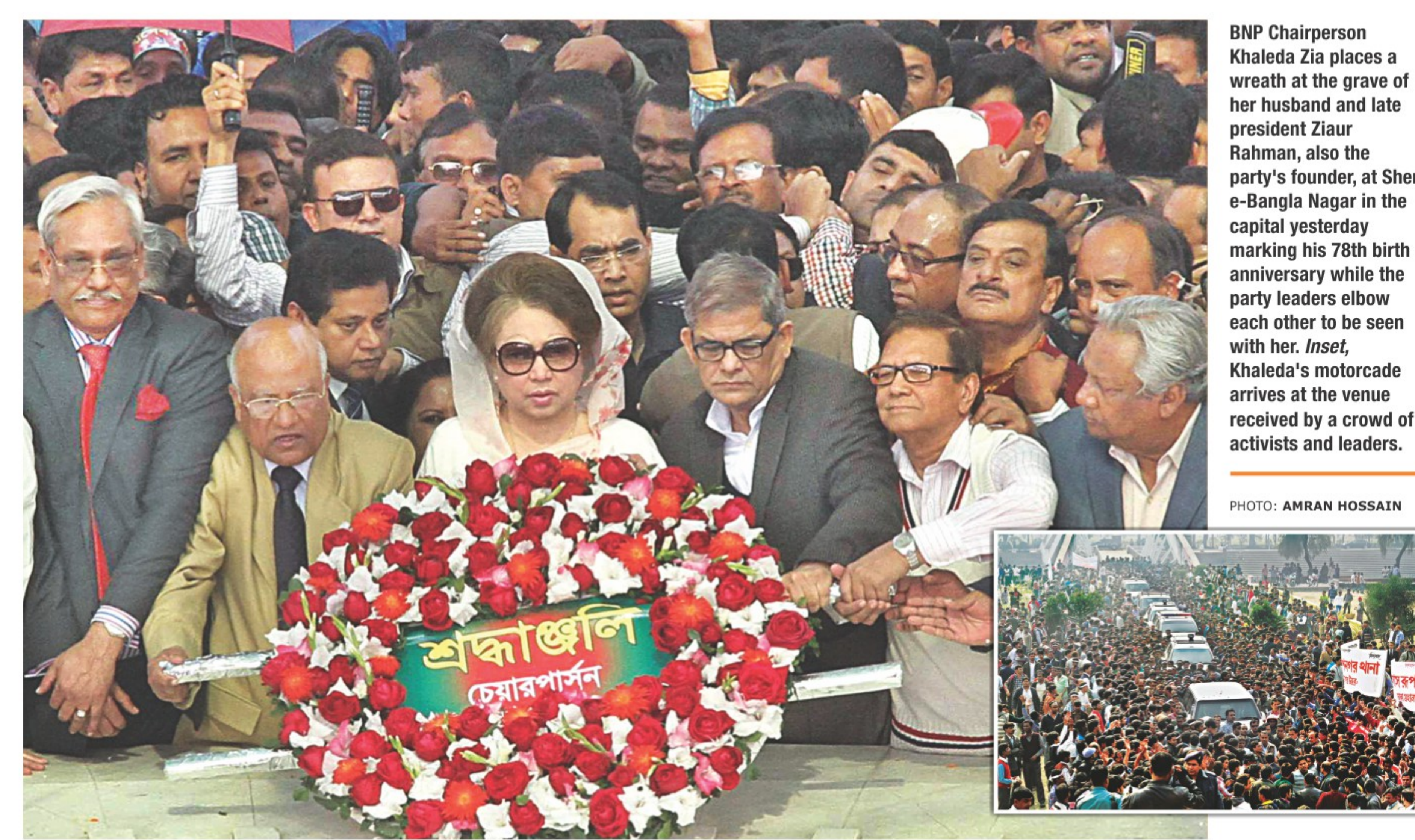
BNP Chairperson Khaleda Zia places a wreath at the grave of her husband and late president Ziaur Rahman, also the party's founder, at Sher-e-Bangla Nagar in the capital yesterday marking his 78th birth anniversary while the party leaders elbow each other to be seen with her. Inset, Khaleda's motorcade arrives at the venue received by a crowd of activists and leaders.