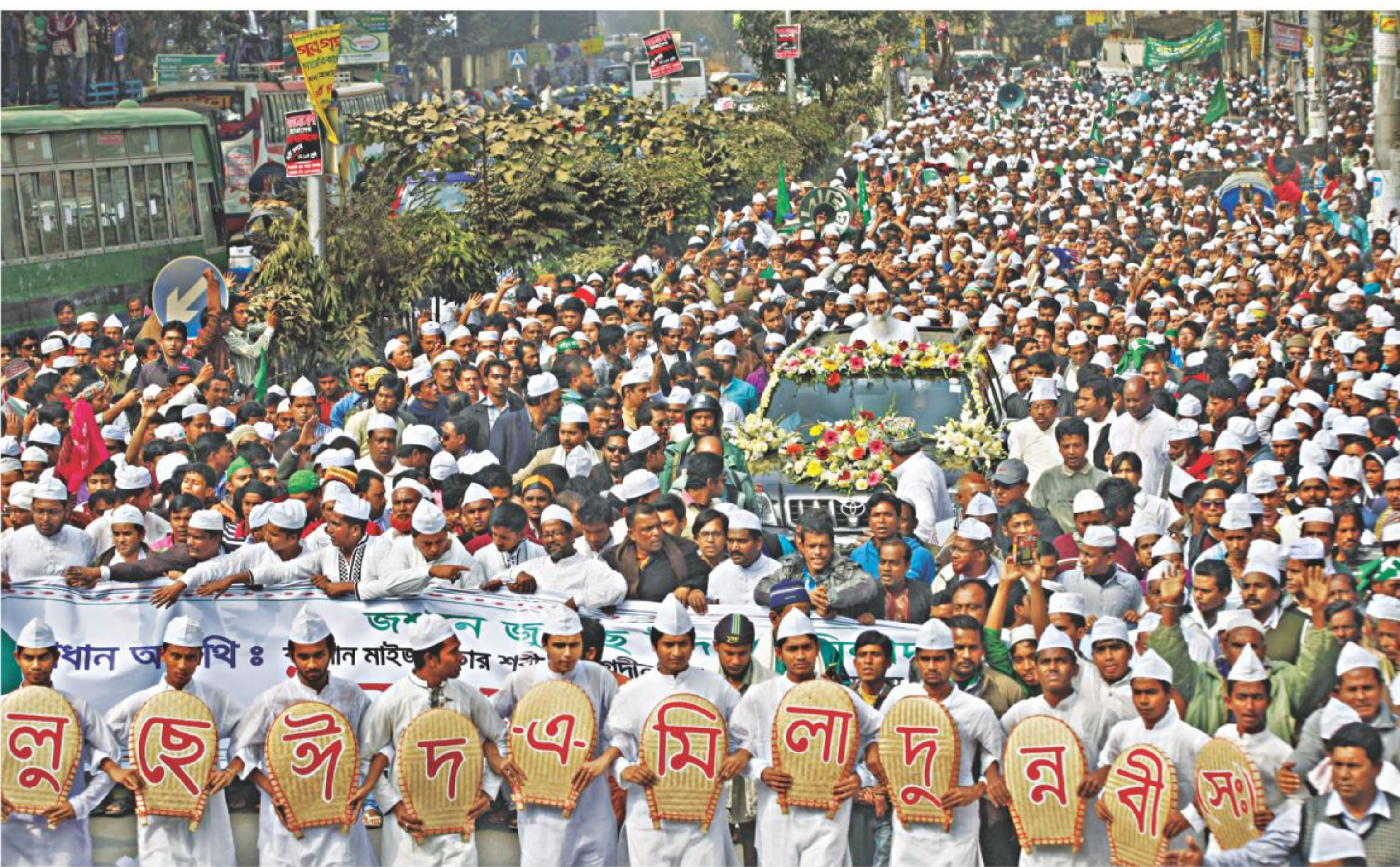
Ashakana Maizbhandary Association brings out a huge procession from Shahjahanpur in the capital on Tuesday to celebrate Eid-e-Miladunnabi.

The court also ordered the IGP to submit a report before it in seven days on what measures have been taken for the protection of the minorities and vulnerable group and what