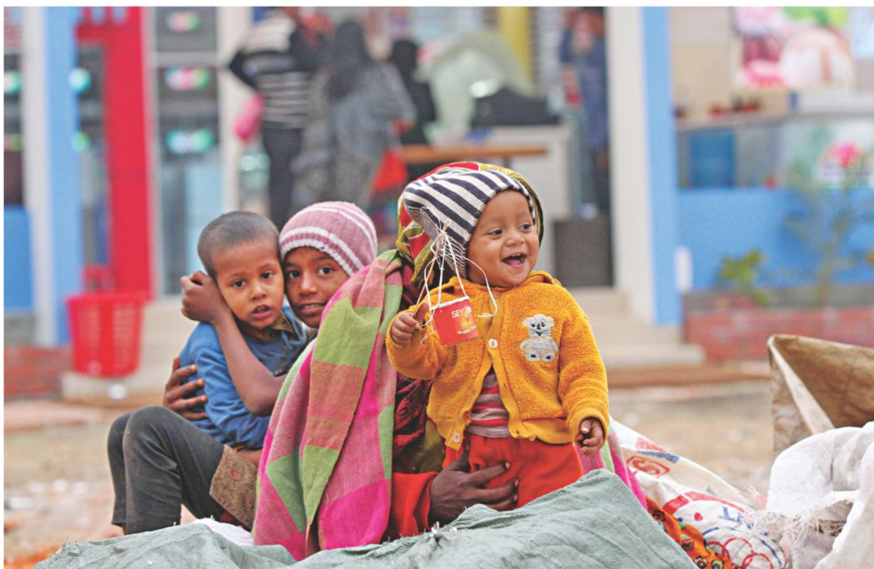
A child from a homeless family plays with a toy, which is just a cup tied to a stick, in the shivering cold at the trade fair in the capital yesterday around stalls full of goodies they can't afford.

The petition was filed following some reports published in The Daily Star and Bangla daily Prothom Alo and Inqilab