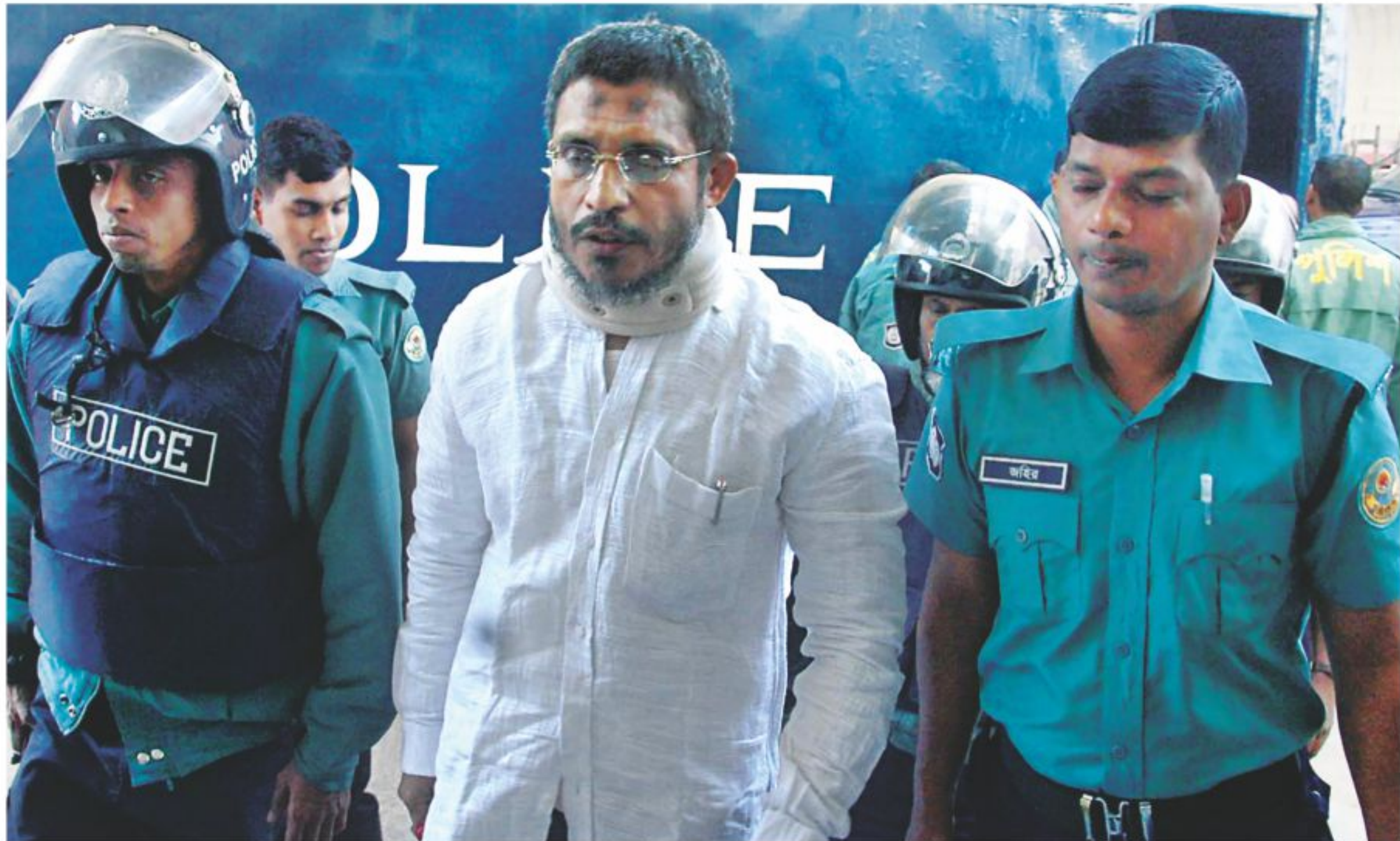
Former home minister Lutfozzaman Babar, an accused in the 10-truck arms haul cases, is being taken to a Chittagong court yesterday.

The two cases, an arms case and a smuggling case, were filed with Karnaphuli Police Station the following day.