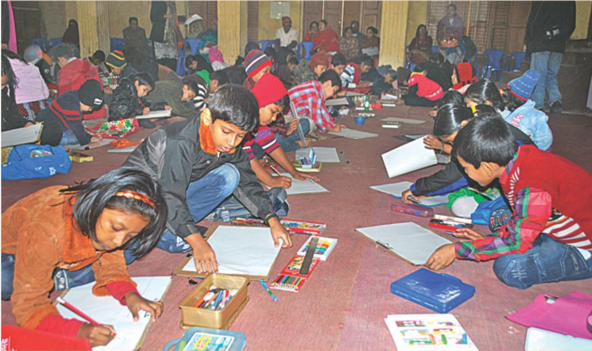
Children at the painting competition.

In 1948, he helped found the Government Institute of Arts and Crafts (Now the Faculty of Fine Arts, Dhaka University) in Dhaka, the first modern art institution in erstwhile East Pakistan, they said. Not confining himself to promoting modern art, he worked tirelessly to encourage folk art in Bangladesh. He founded the Folk Art Museum at Sonargaon near Dhaka in 1975 and became actively involved in a movement to preserve the cultural heritage of