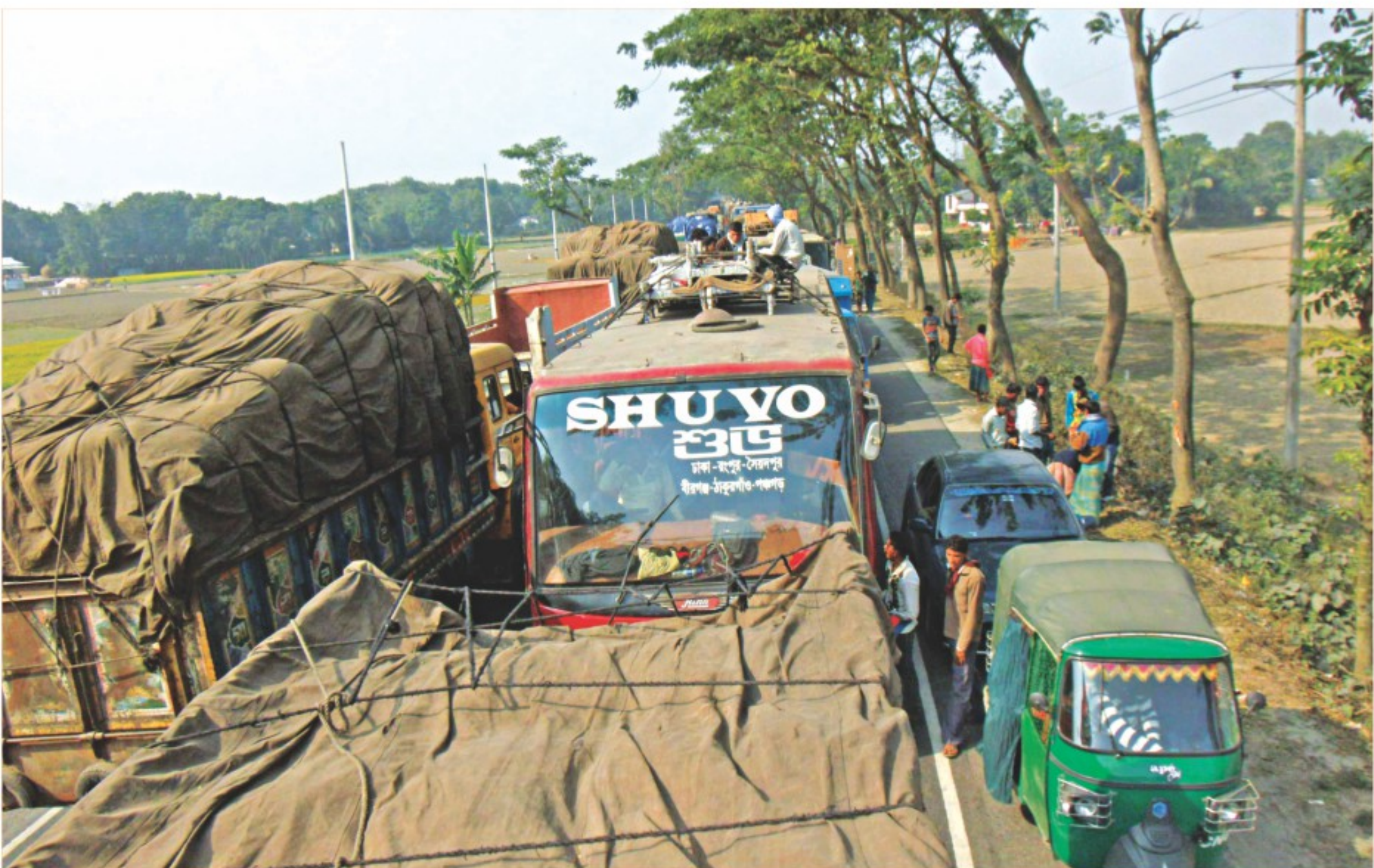
Vehicles stuck in a long tailback on Dhaka-Tangail highway in Tangail around 2:30pm yesterday.