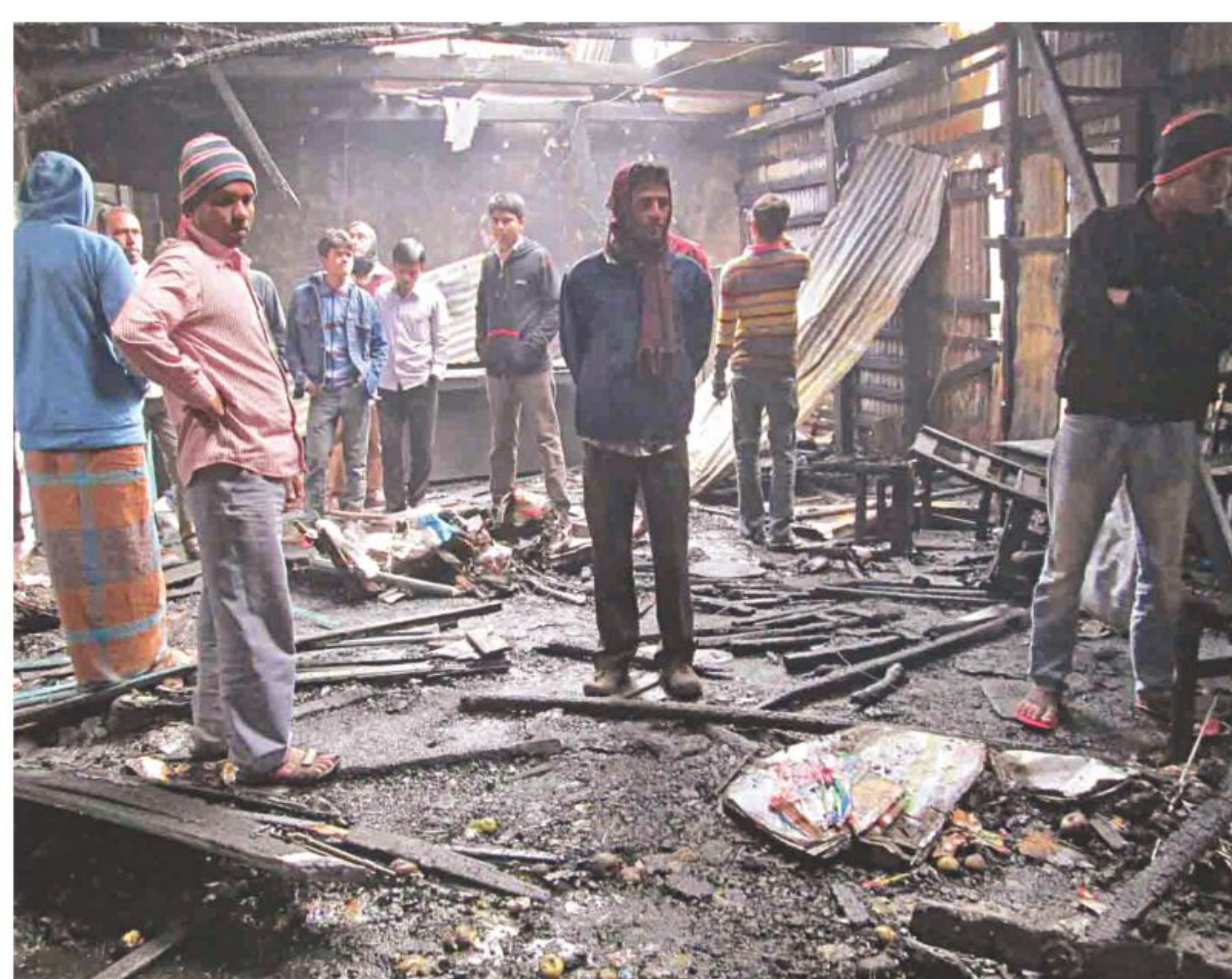
POLITICS OF VENGEANCE: The burning BNP office, left , on Post Office Road, and the ruins of the Awami League office, right , on the main road in Pirojpur district town yesterday. The activists of the opposing parties allegedly set fire to each other's office.