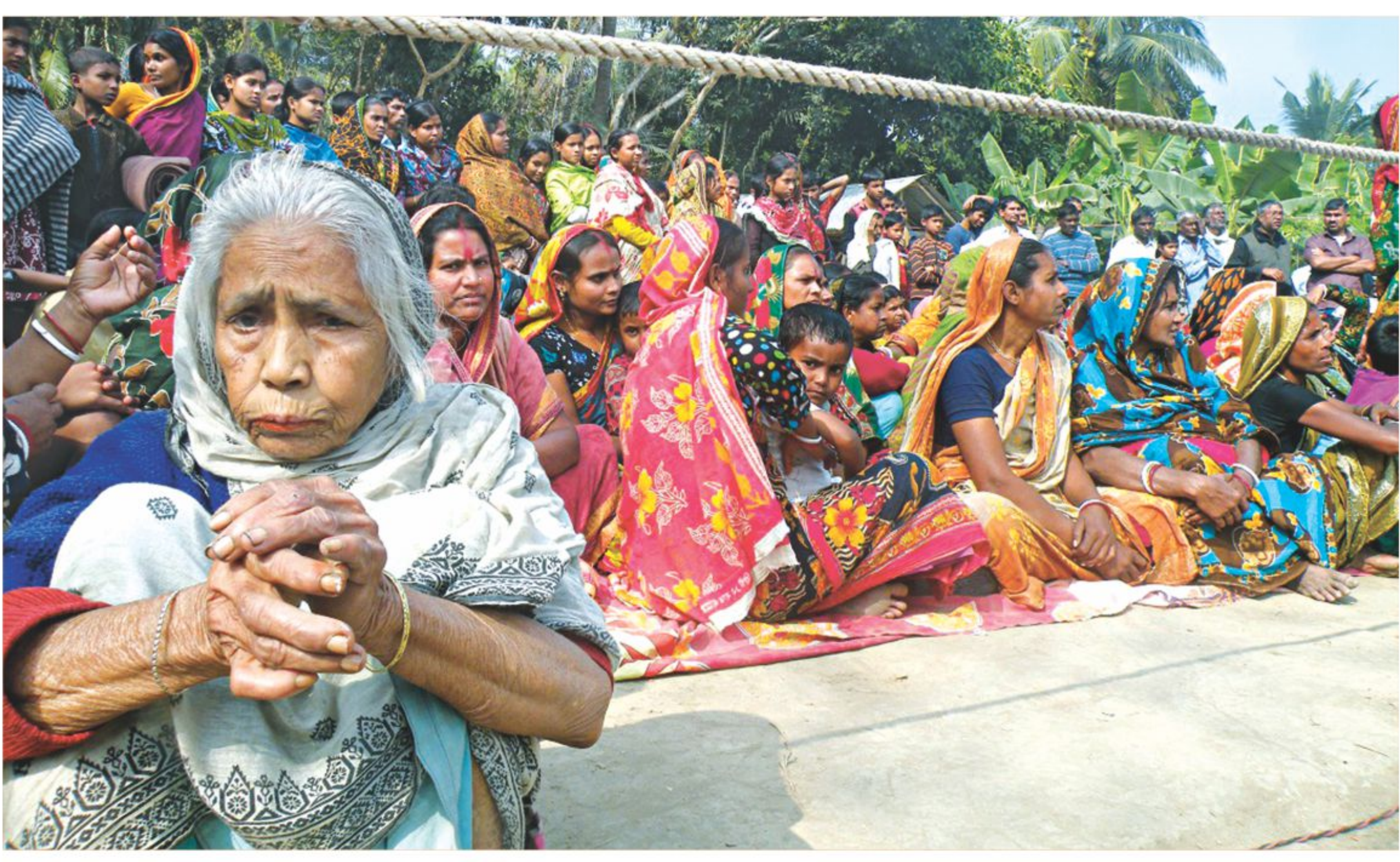
An elderly woman waits in an area cordoned off by a rope at Malopara village in Abhaynagar of Jessore yesterday. Victims of post-polls violence against Hindus gathered there as different organisations distributed relief materials.