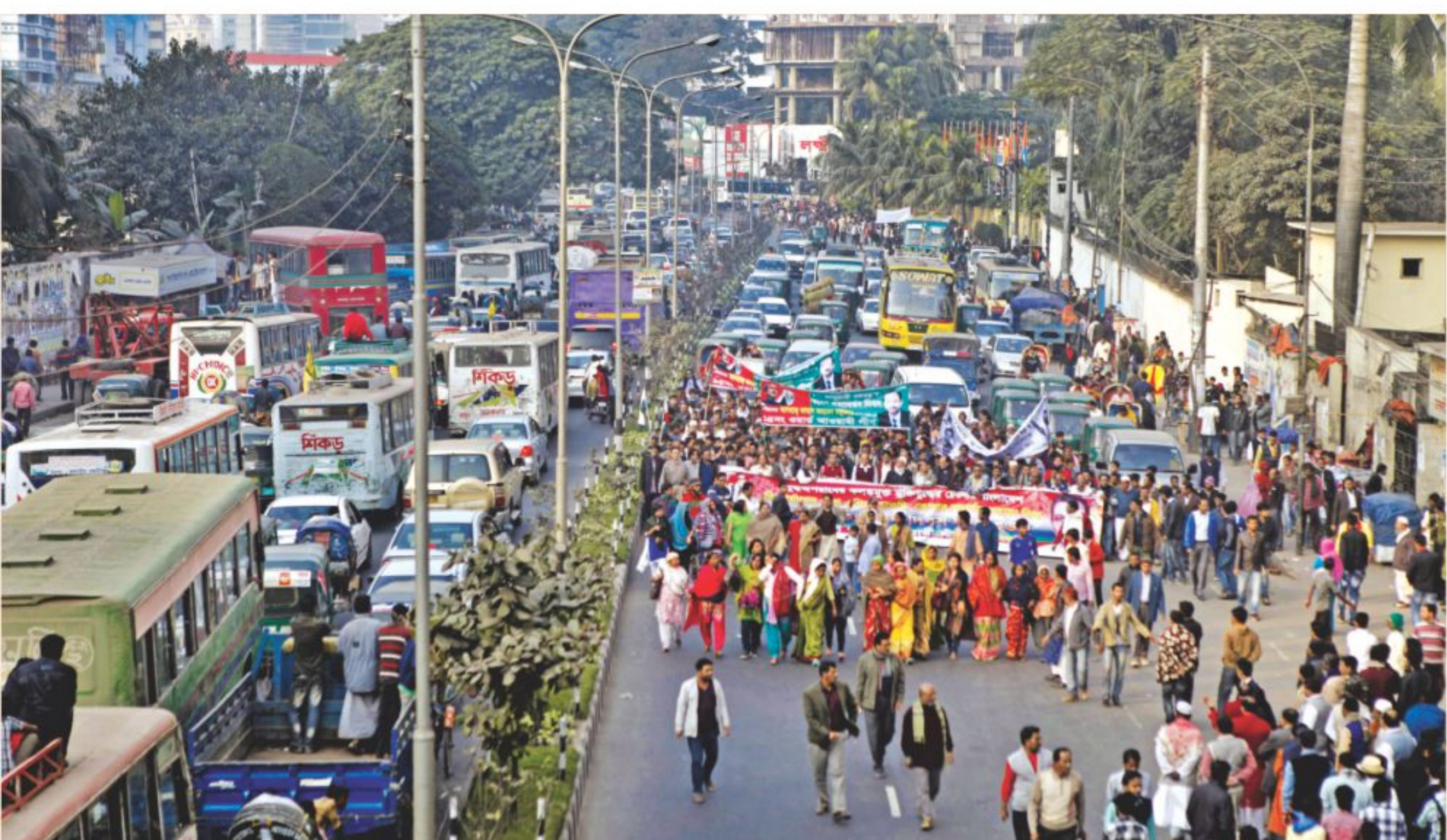
A ruling-party procession at Shahbagh heads towards Suhrawardy Udyan yesterday afternoon to join an Awami League rally there. Several such small processions from places in the capital went to the rally triggering a traffic nightmare on the first blockade-free day of the year. It was late into the night when congestion finally eased.