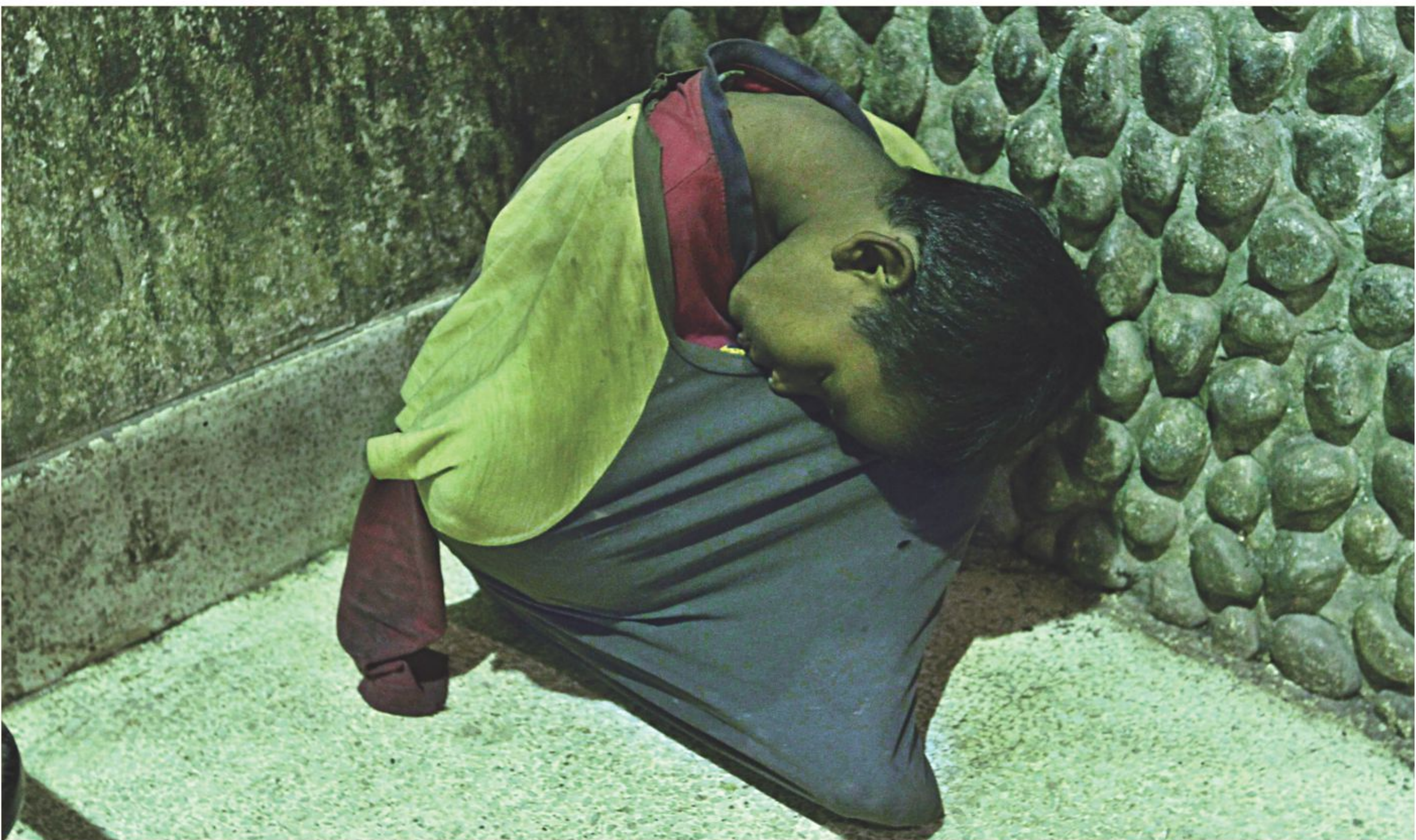
He tucked his limbs inside the flimsy T-shirt torn in places. He managed to fall asleep in a corner where the draught was “bearable”, albeit in a very awkward position. The photo of the boy was taken at Kamalapur Railway Station at 2:30am in the shivering cold yesterday. City in Frame -- page 16.