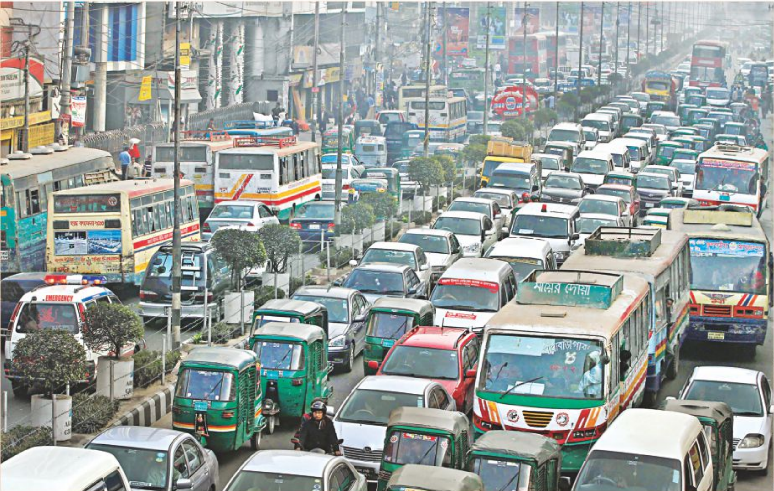
Tired of the arson, vandalism, violence, blockades, and hartals of the last few months, city dwellers yesterday ignored all risks and went about their business. The shot of the gridlocks was taken at Kazi Nazrul Islam Avenue yesterday.