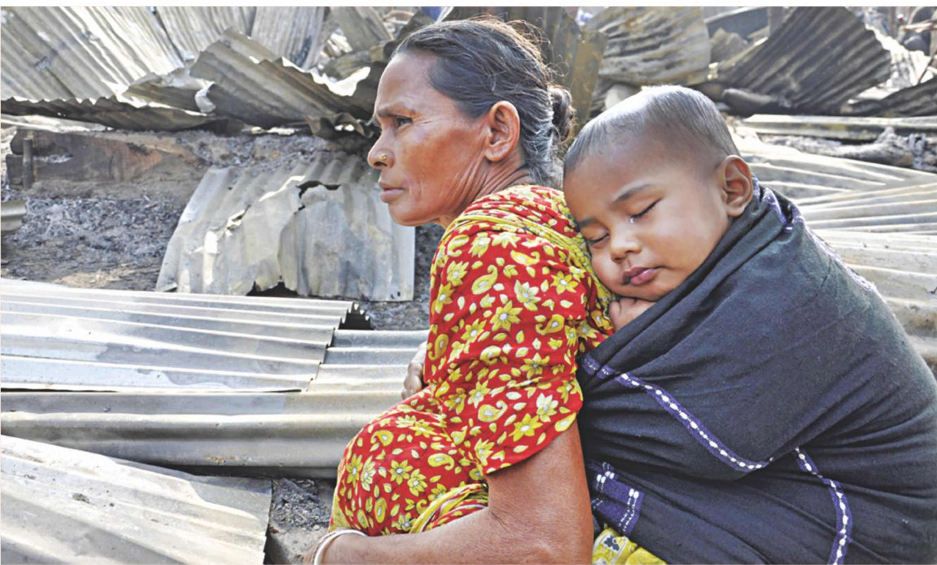
A Hindu woman with an infant on her back in front of the devastation at Karnai village of Dinajpur yesterday. The village witnessed one of the worst incidents of violence against the minorities after the January 5 elections.