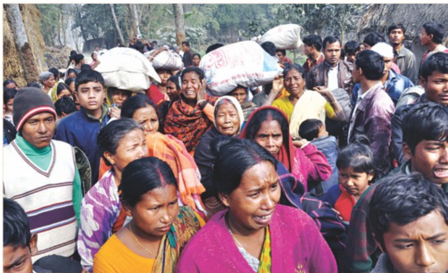
Hundreds of local Hindus take refuge at a temple in Goreya upazila since Sunday night in fear of attacks by Jamaat-BNP men. Hindus and Awami Leaguers of Chehelgazi union in Dinajpur, left, attempt to leave the area following attacks on their homes, businesses and properties. Jamaat-Shibir men go on the rampage, right, in Kornai Bazar of Dinajpur Sunday evening.