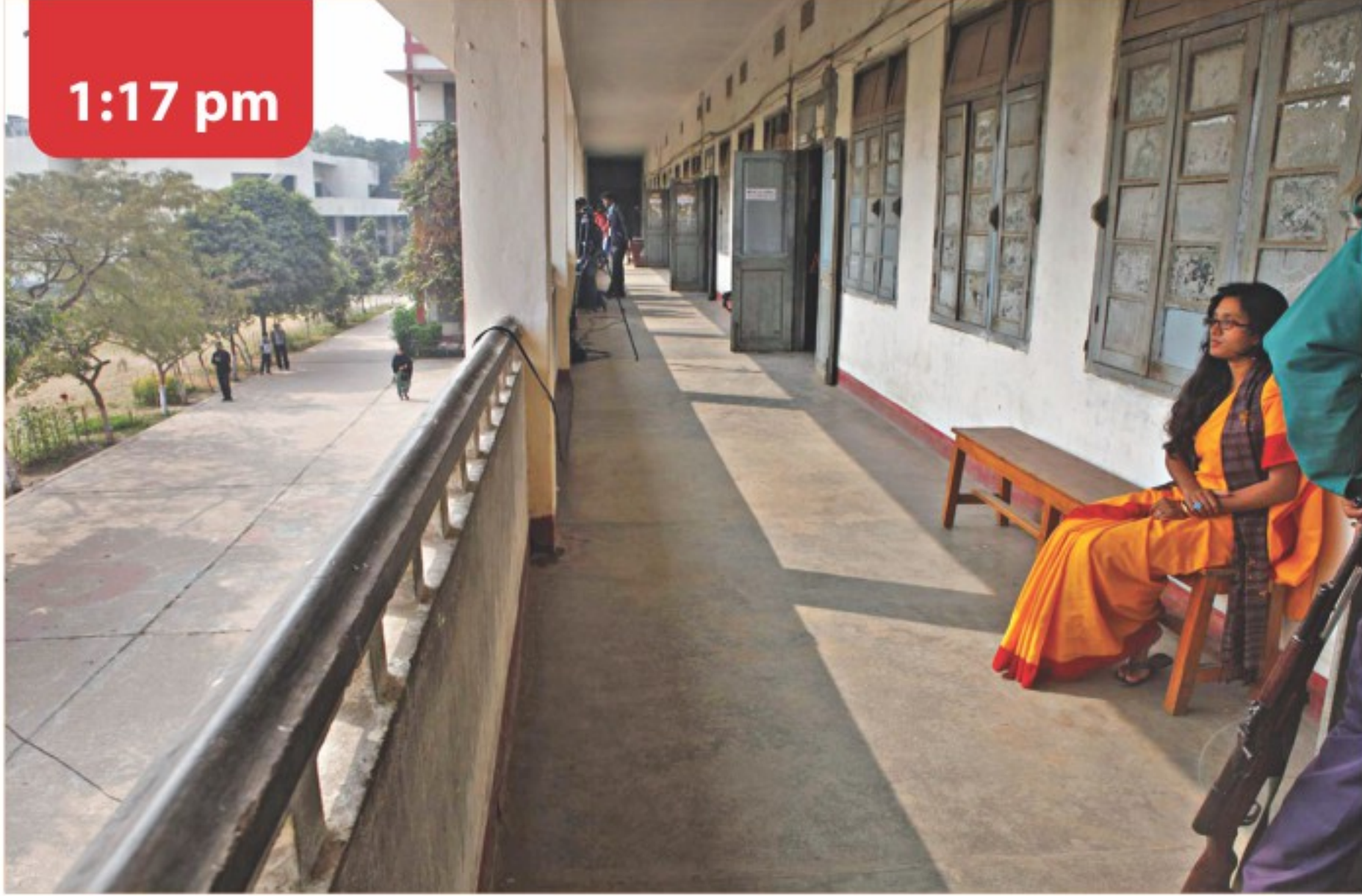
The same frame captured at four different moments during the polling at Azimpur Girls School and College centre in Dhaka yesterday.