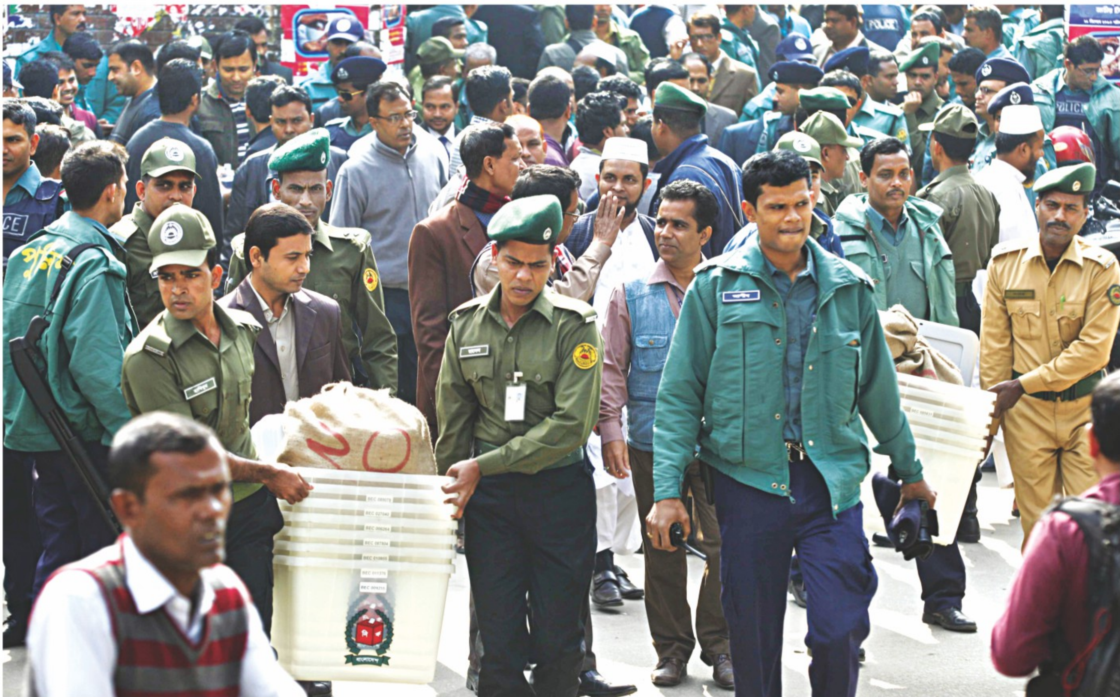
Ansars and policemen take electoral materials to their designated polling station yesterday from the temporary Election Commission office setup at a community centre in Lalbagh of the capital.