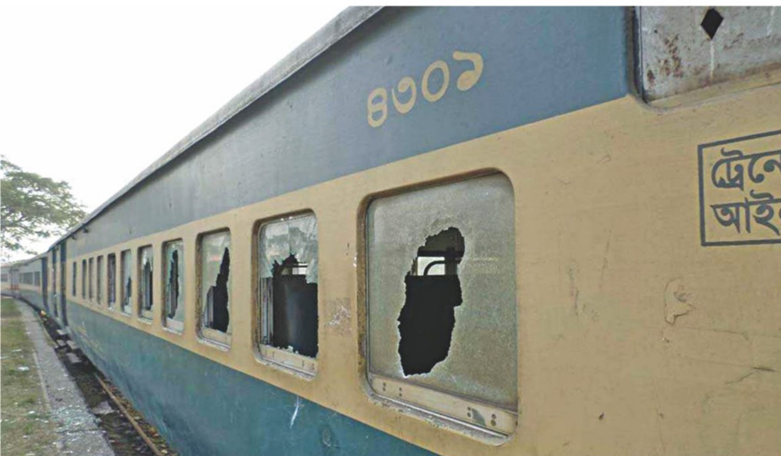
Supporters of the opposition-called hartal vandalise a train stationary at the Ishwardi Railway Junction yesterday morning.