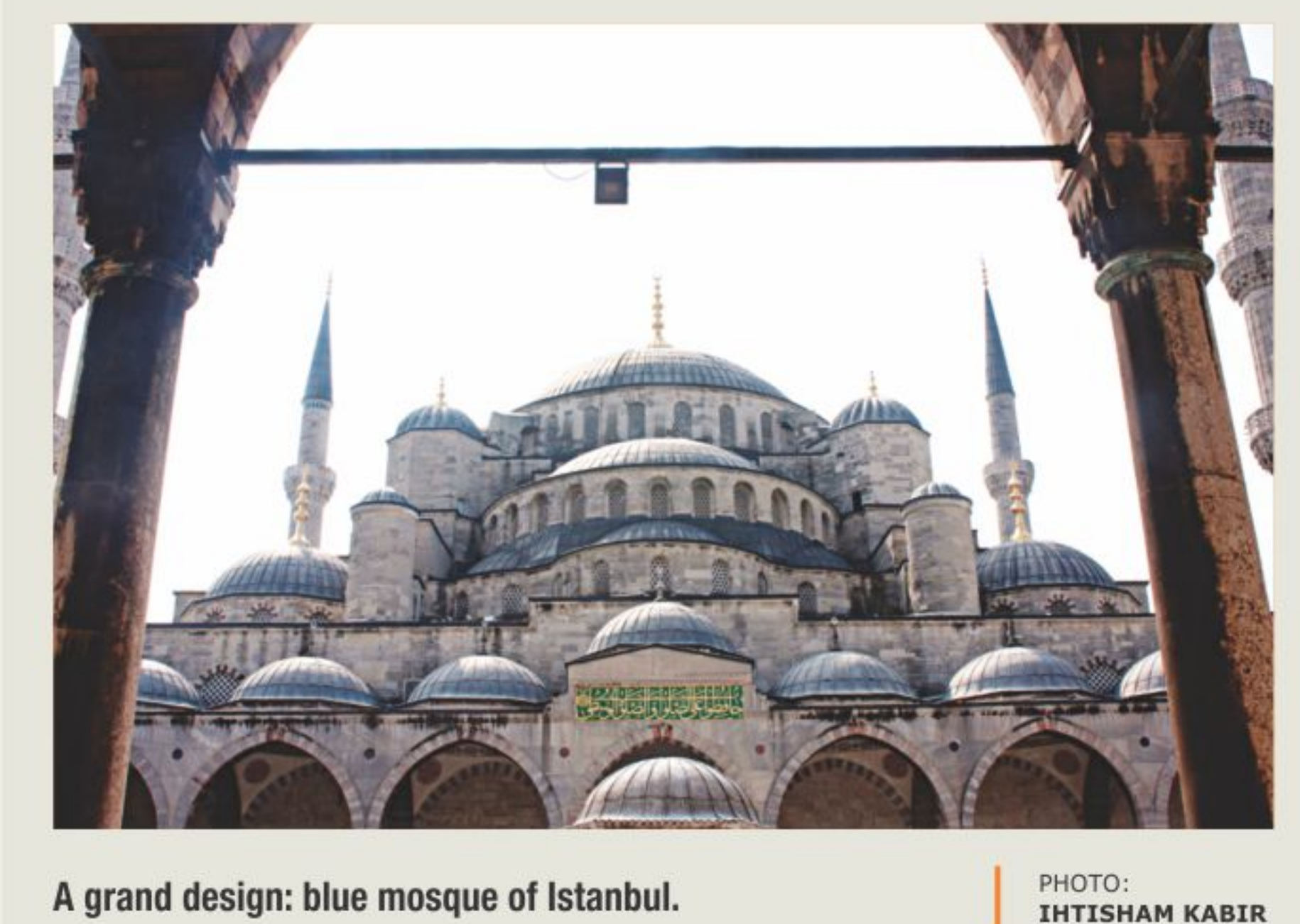
A grand design: blue mosque of Istanbul.