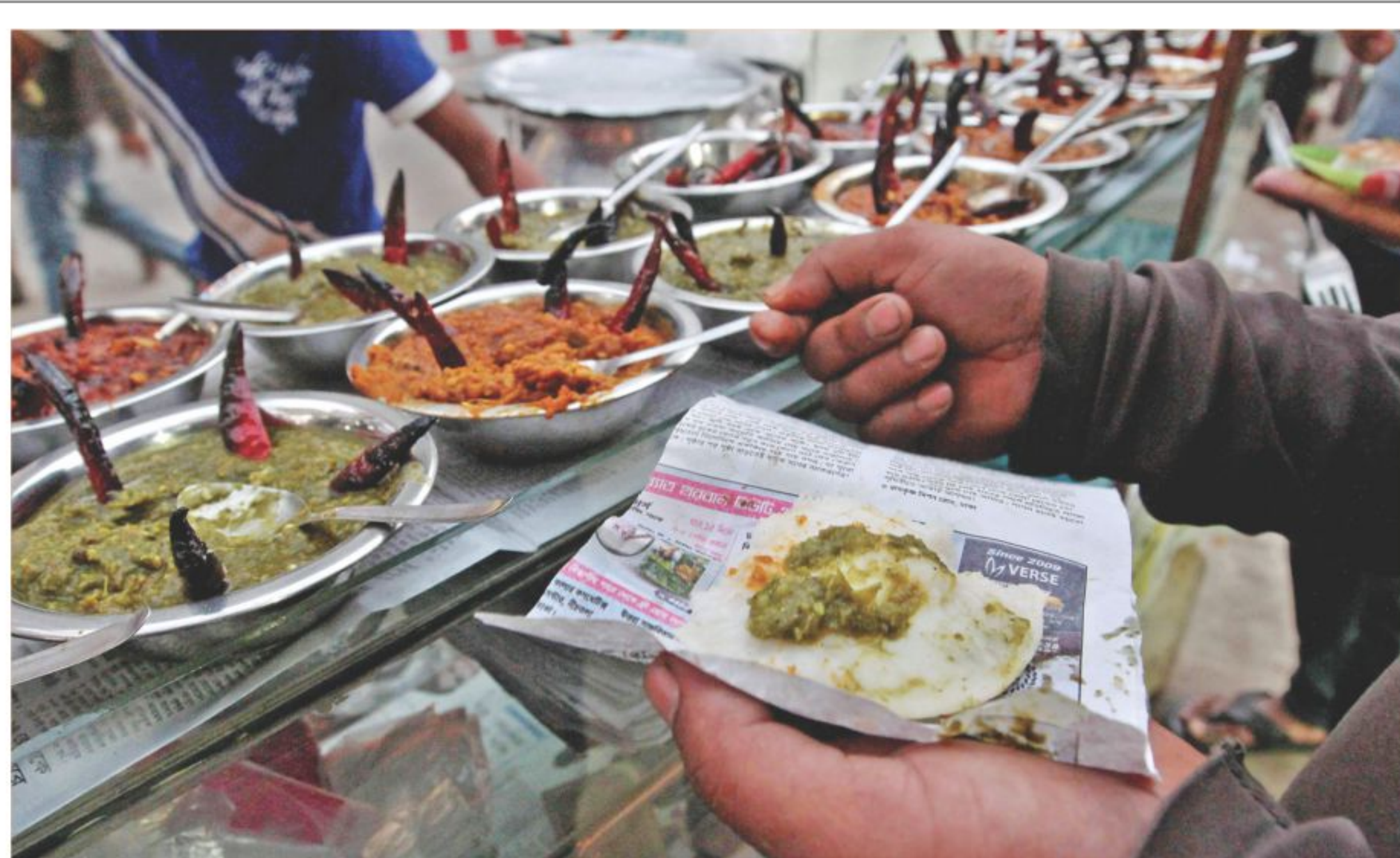
A customer spreads a variety of hot sauce on Chital/Chitro pitha at a roadside stall on Green Road in the capital yesterday. Pitha shops spring up across the city during winter to cater to people's desire for the mouth-watering treats. See City in Frame on page 16.