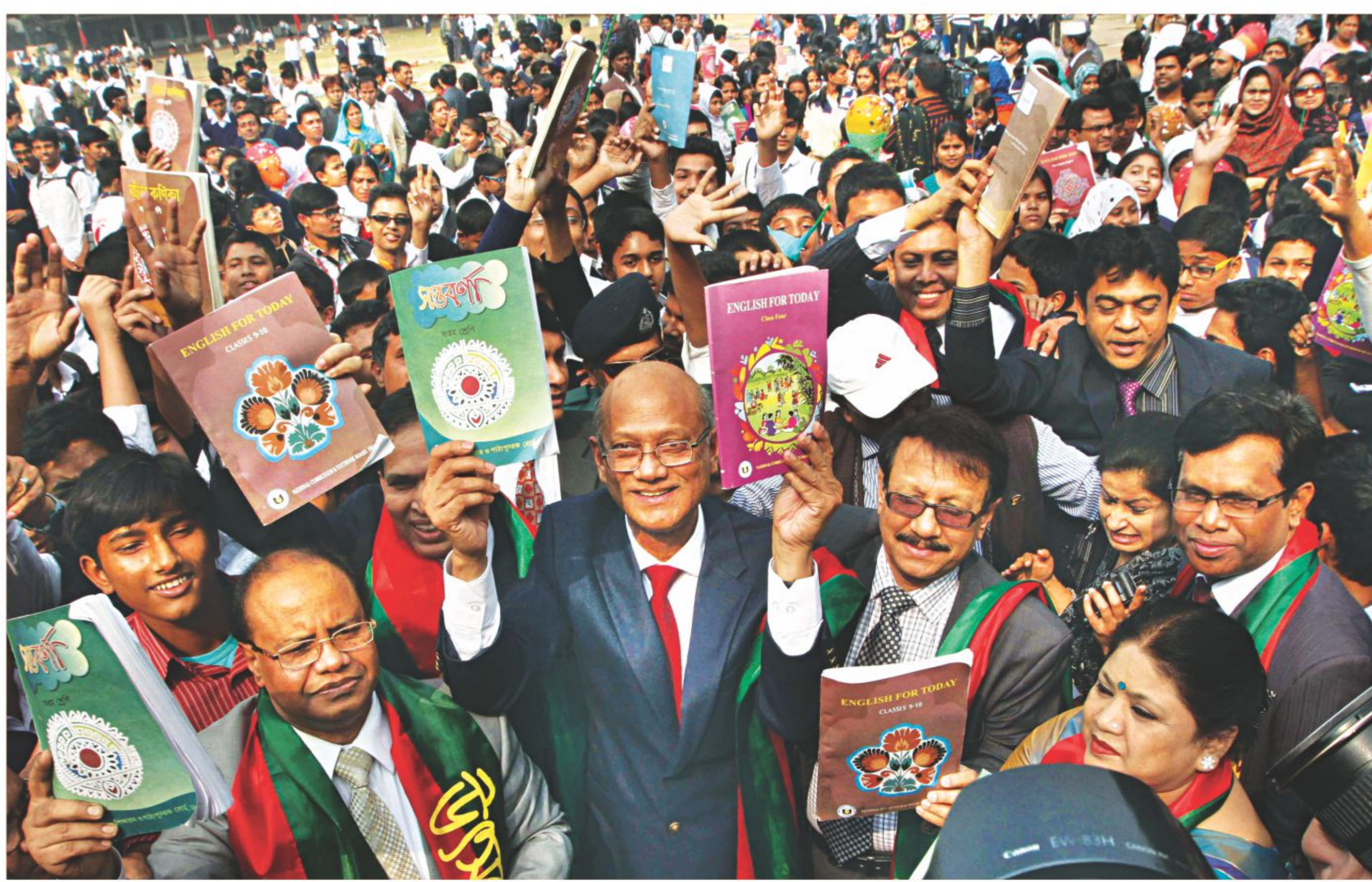
Celebrating the distribution of textbooks for the new academic year, Education Minister Nurul Islam Nahid shows the books along with students of Govt Laboratory High School in Dhaka yesterday.