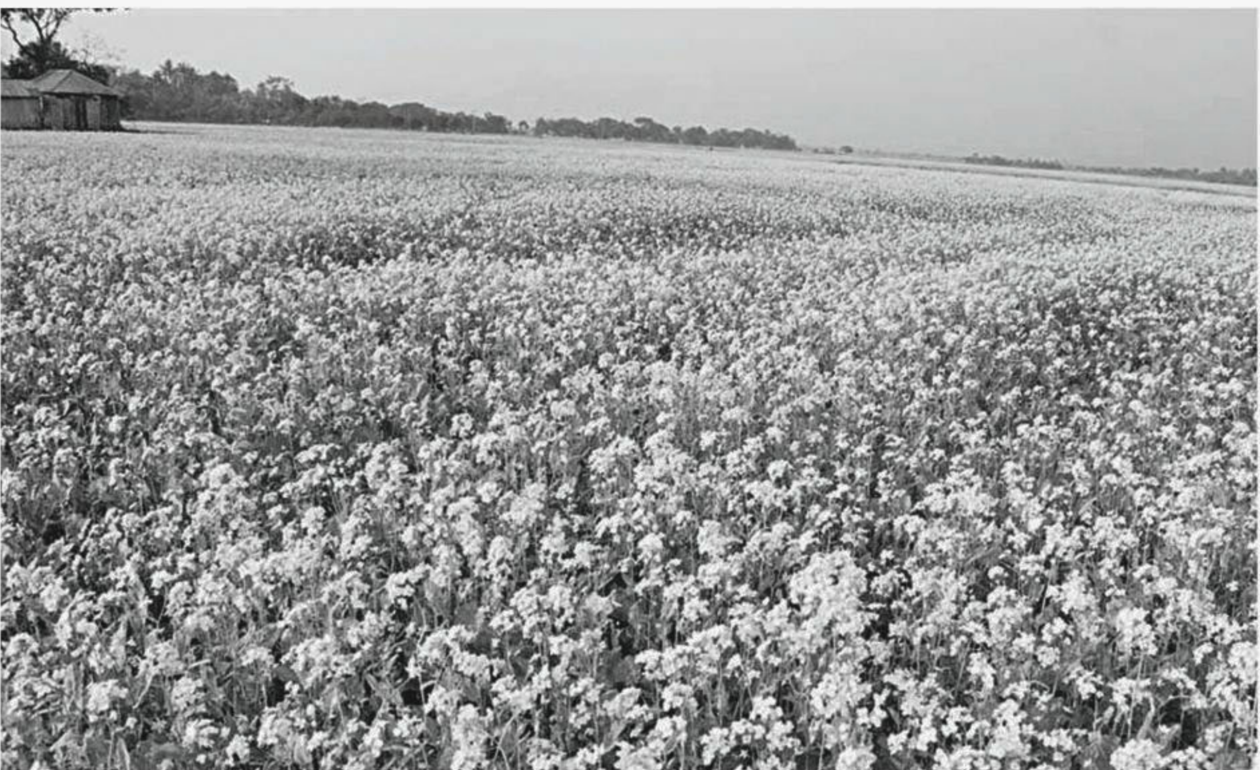
As far as eyes go, the charming yellow of mustard flowers blooming on vast tracts of land in Pabna raise hope of a bumper production this year. The phot was taken from Nazirpur village in Sadar upazila on Wednesday.