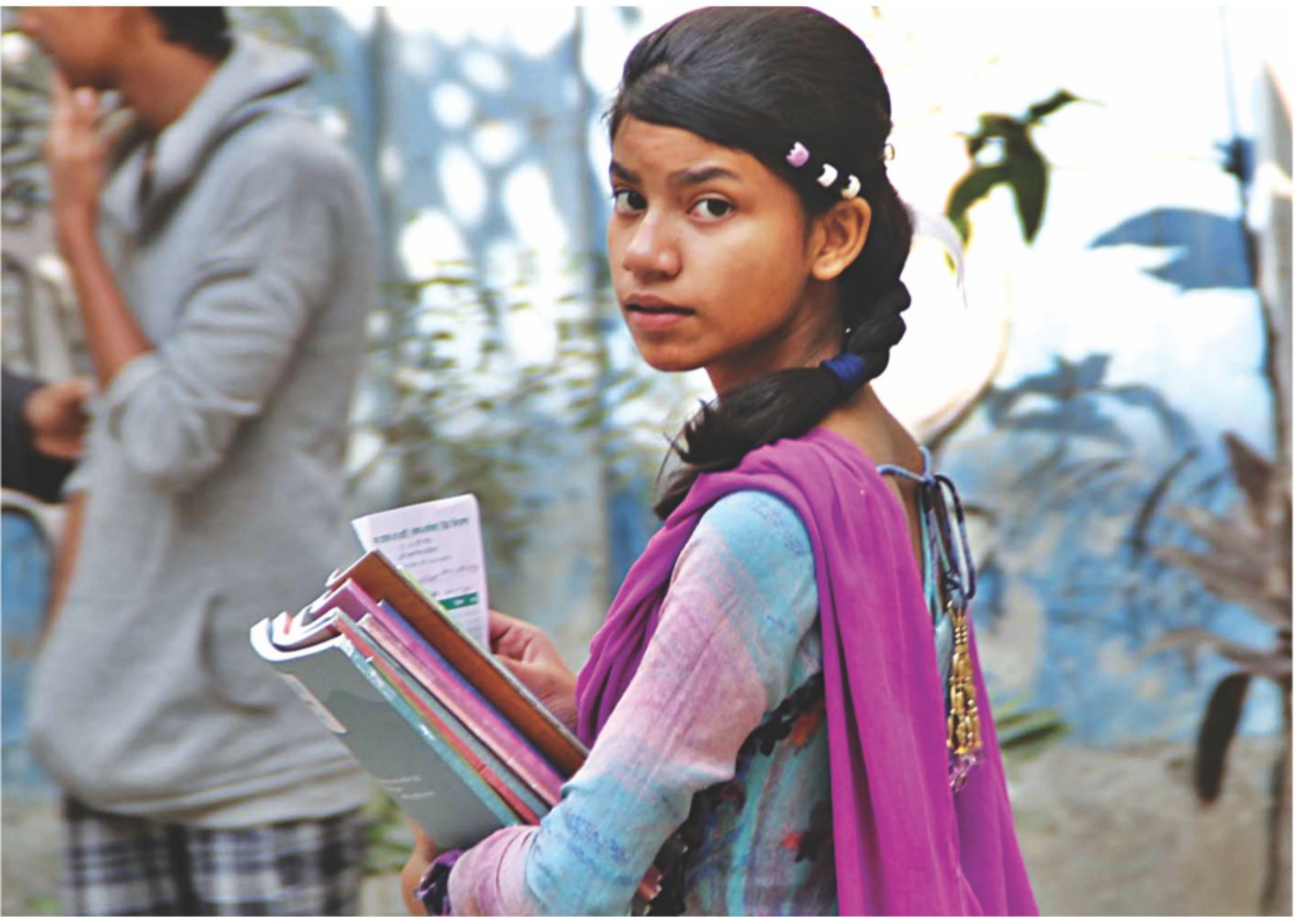
Although free distribution of textbooks for school children is supposed to begin in the New Year, a school in Chittagong gave those to students on the last day of the outgoing year yesterday as nobody knows what lies ahead amid a volatile political situation.