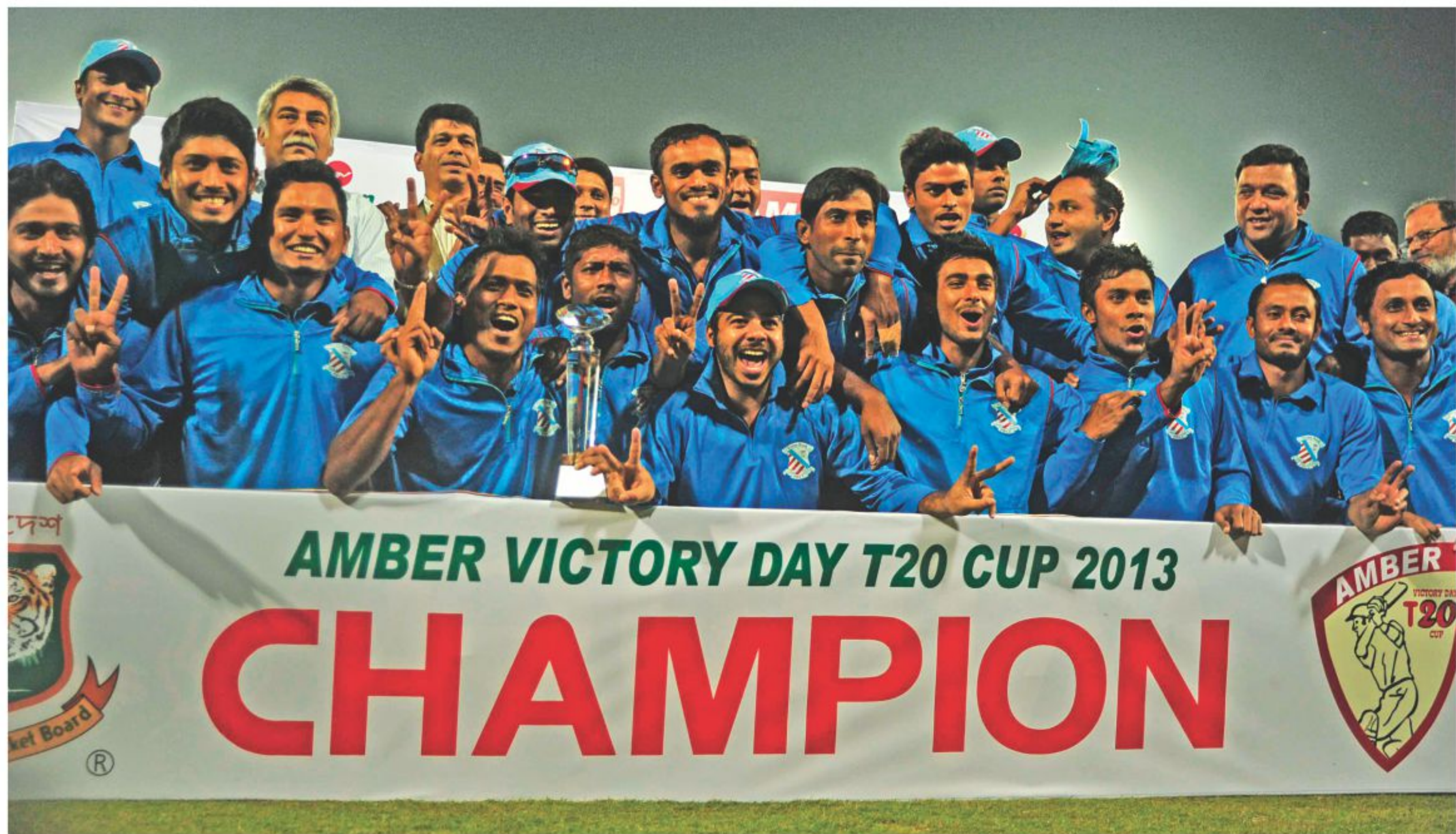
Players and officials of Prime Bank Cricket Club rejoice with the Victory Day T20 Cup trophy after they beat United Commercial Bank BCB XI in the final at Mirpur's Sher-e-Bangla National Stadium on Tuesday.