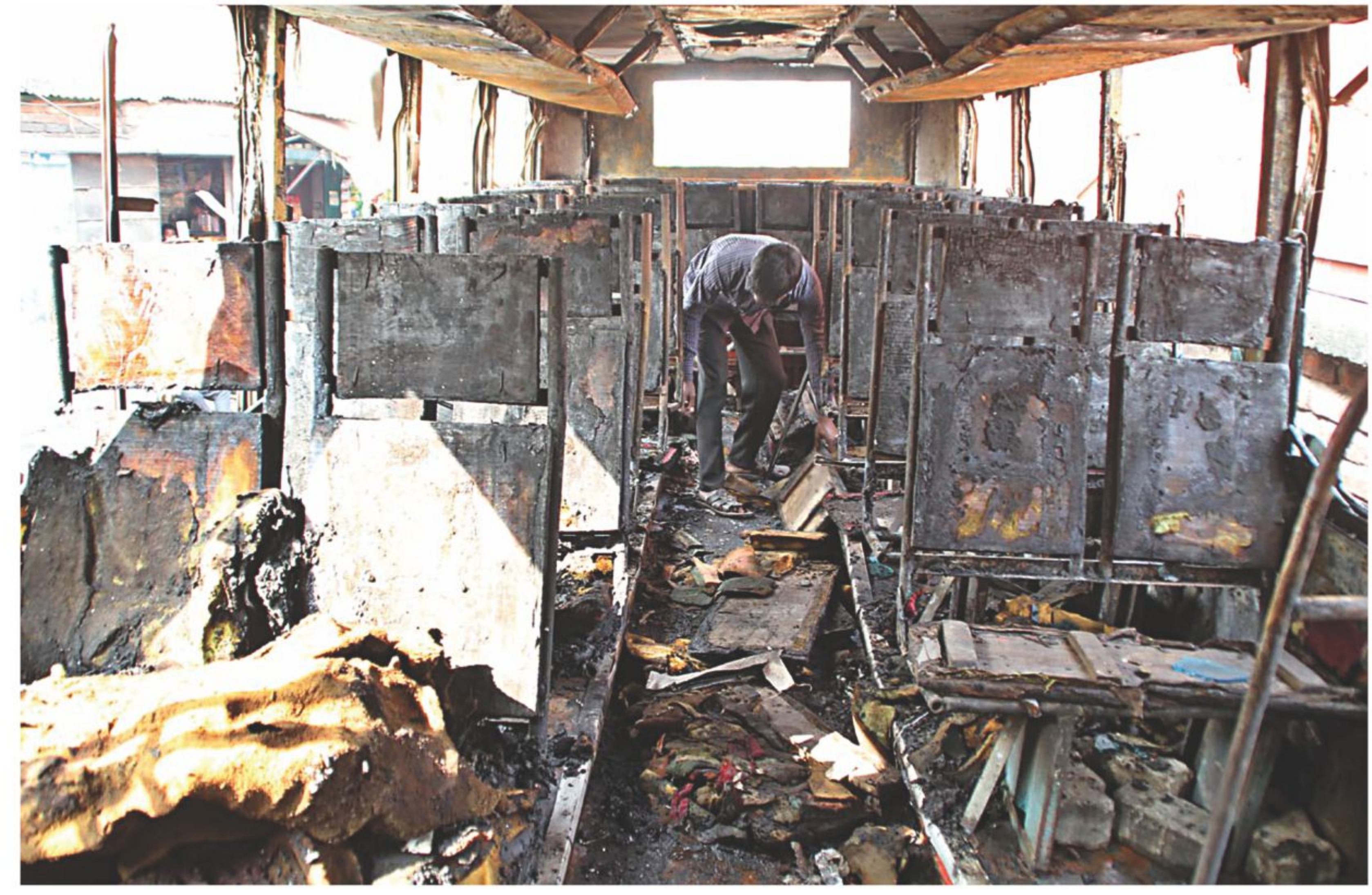
Although the BNP-led 18-party alliance enforced countrywide blockade ended at 5:00pm on Tuesday, opposition activists torched this bus while it was parked in Chittagong city's Munshir Dighir Par early yesterday.