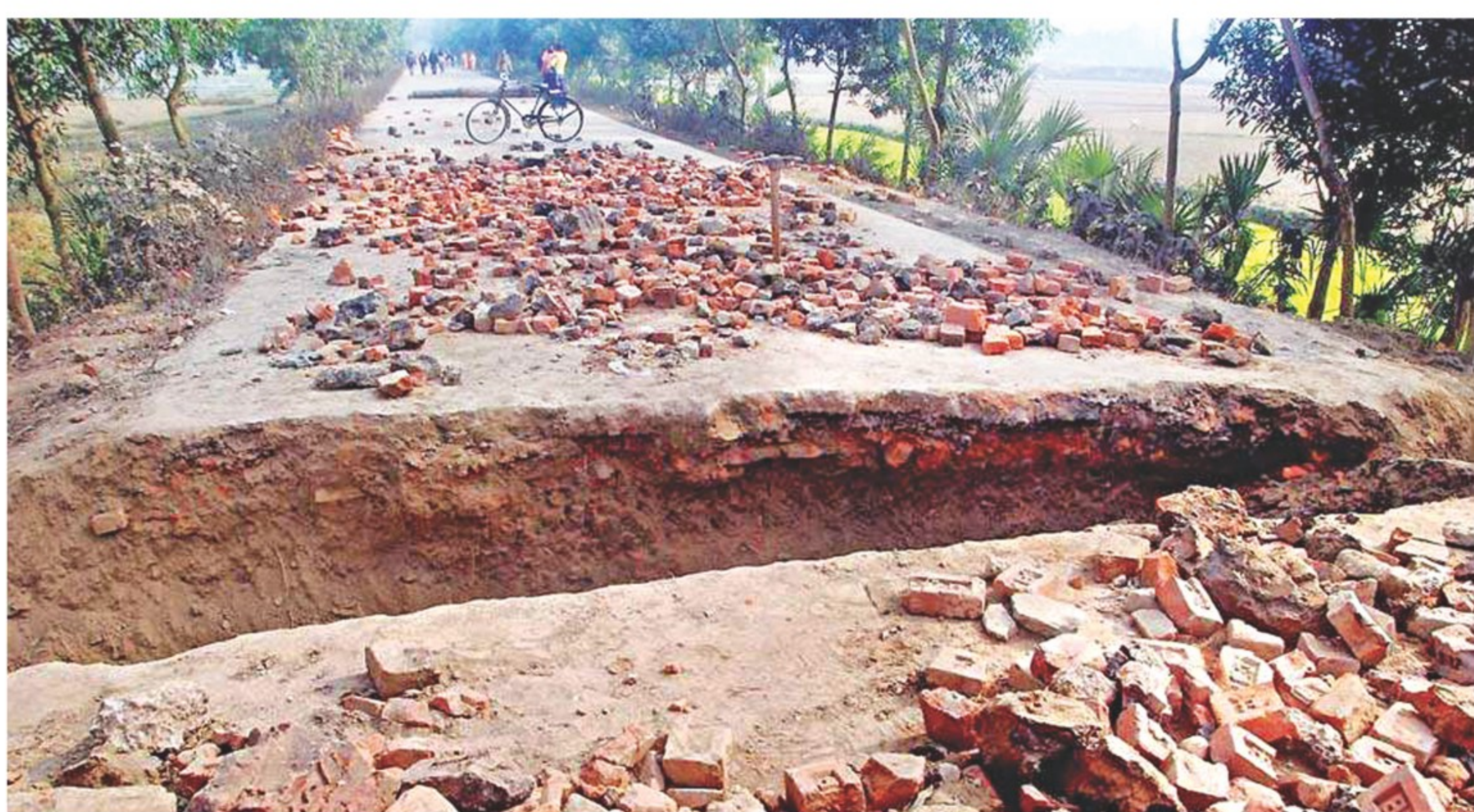
Opposition-called blockade supporters yesterday dug up a trench at Goreya on Gaibandha-Palashbari road, severing road communications between Gaibandha and other districts.

STAR REPORT Fed up with long blockades that wreaked havoc on people's lives and livelihood for the last one month, people have lately been defying the political programmes despite fear of violence. A large number of vehicles plied the streets of Dhaka and other major cities yesterday, the second day of 83-hour blockade enforced by the BNP-led 18-party alliance. Many businesses, offices and roadside shops were seen open in Chittagong, Rajshahi, Barisal, Khulna and Sylhet cities, report our district correspondents. As the number of vehicles including minibuses, CNG-run auto-rickshaws and private cars, increased on the capital's streets, some areas even saw traffic congestion in the evening. Train and launch services on all routes remained normal SEE PAGE 10 COL 1