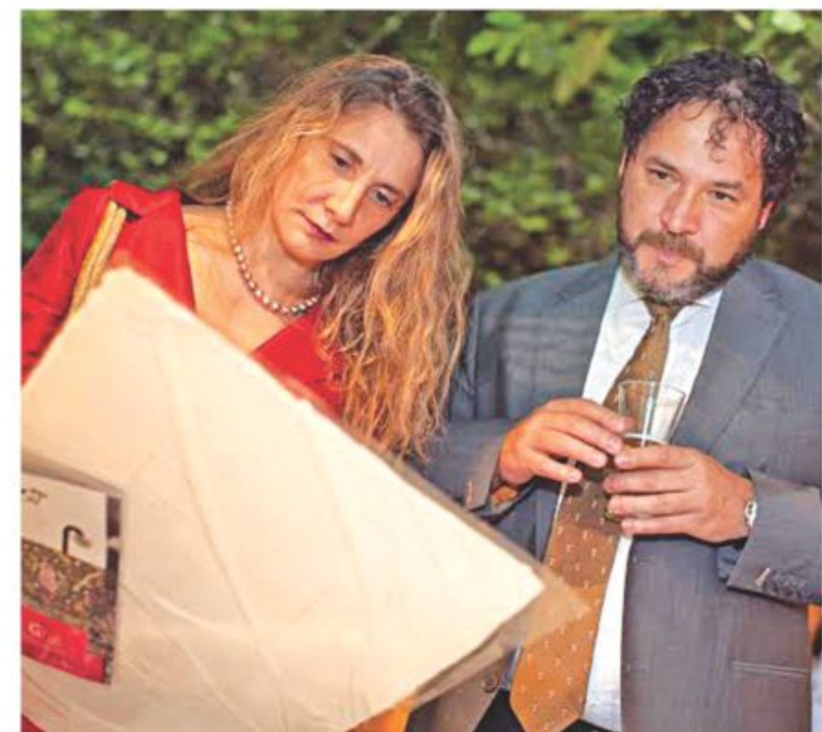
Visitors at the exhibition.

The mediums used included watercolour, acrylic, oil, mixed media and more. There were artworks done in realistic, semi-realistic, figurative, surrealist, abstract-expressionism, non-figurative, folk with techniques using varied compositions, colours, textures, lines and forms.