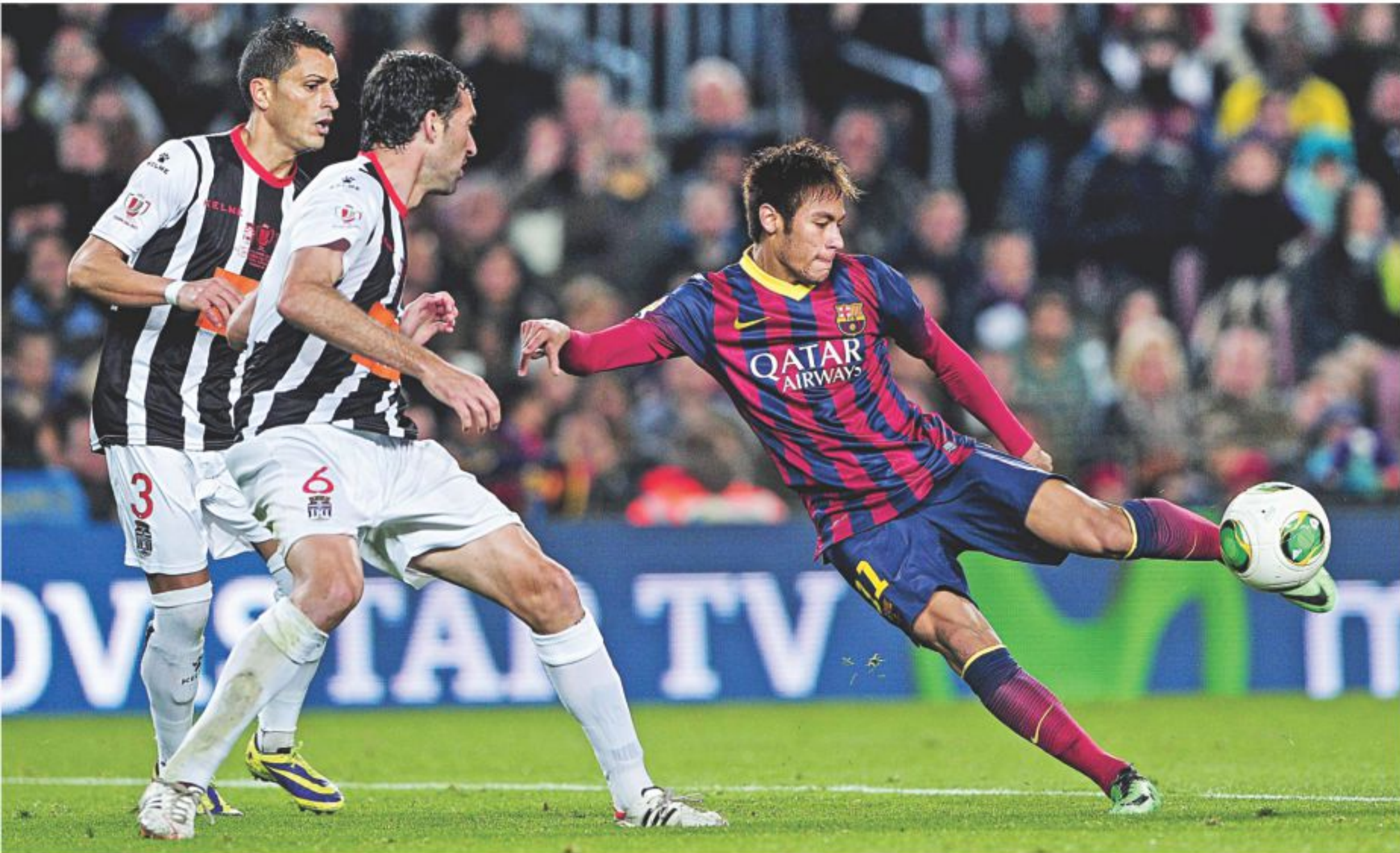
Barcelona starlet Neymar (R) takes a shot during their Copa del Rey match against FC Cartagena at the Nou Camp on Tuesday.

"During the two training sessions on the second we hope to have all the players back together, including those that are continuing to recover like Leo and Victor."