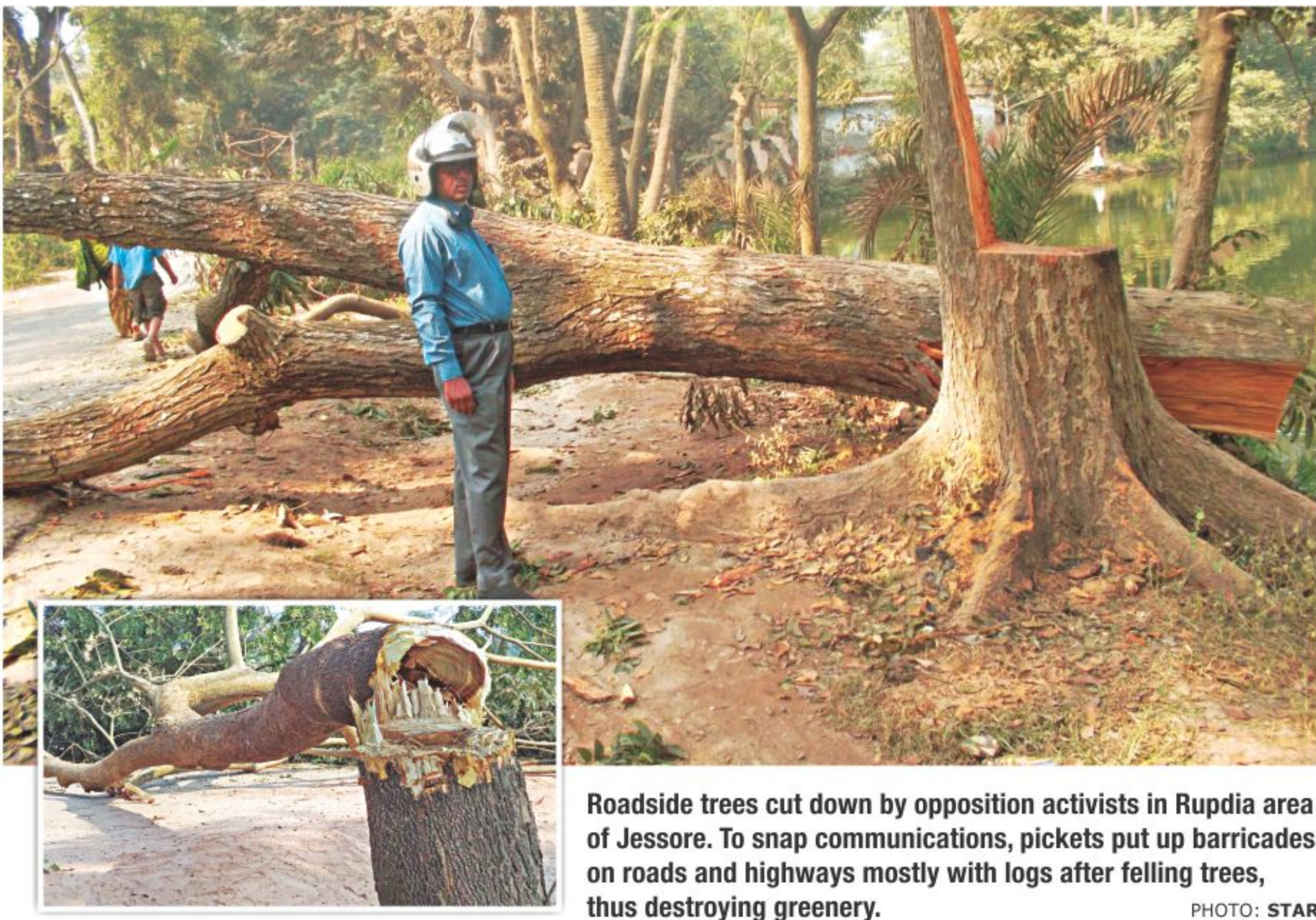
Roadside trees cut down by opposition activists in Rupdia area of Jessore. To snap communications, pickets put up barricades on roads and highways mostly with logs after felling trees, thus destroying greenery.