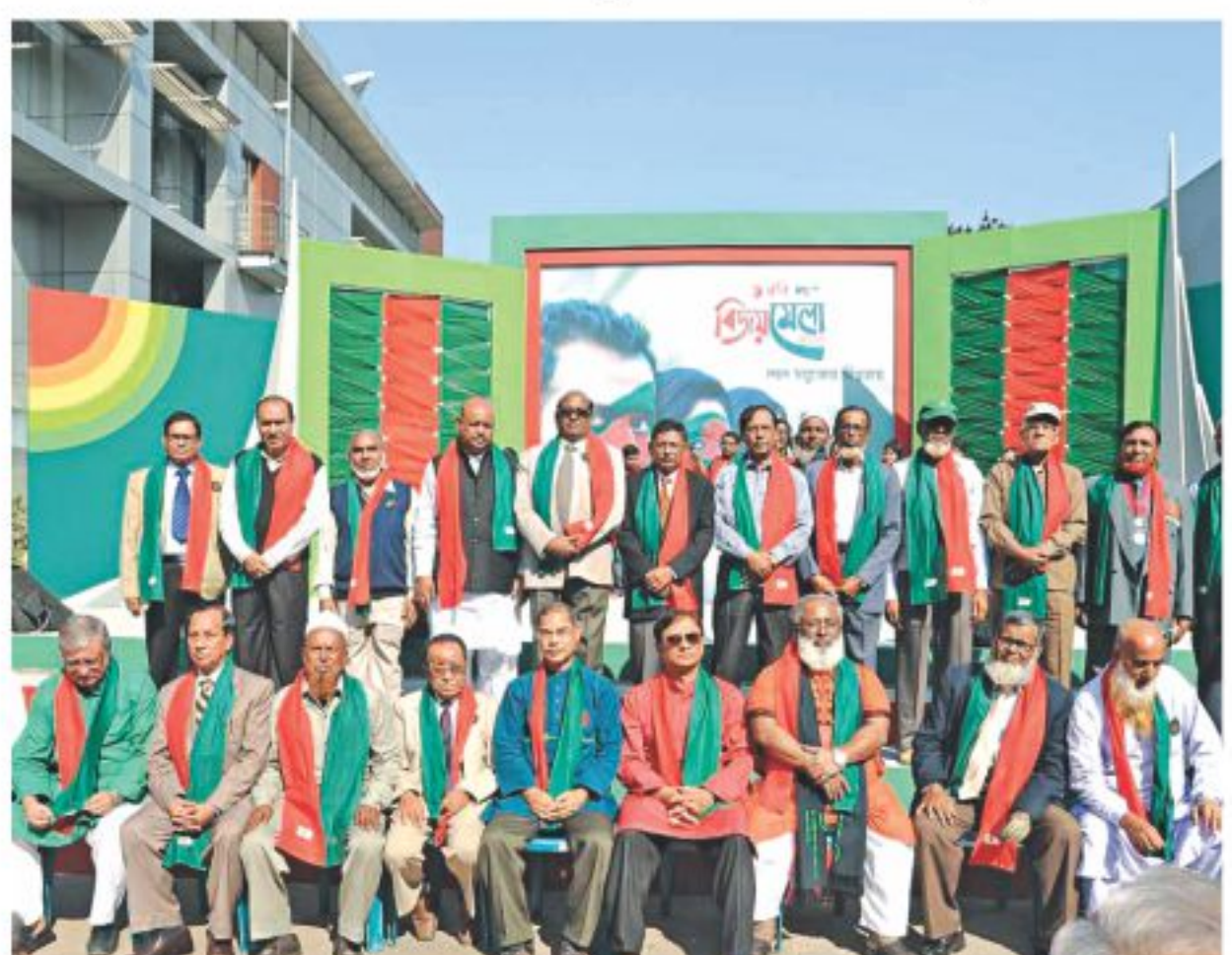
Freedom Fighters inaugurate the Victory Fair at Channel i.