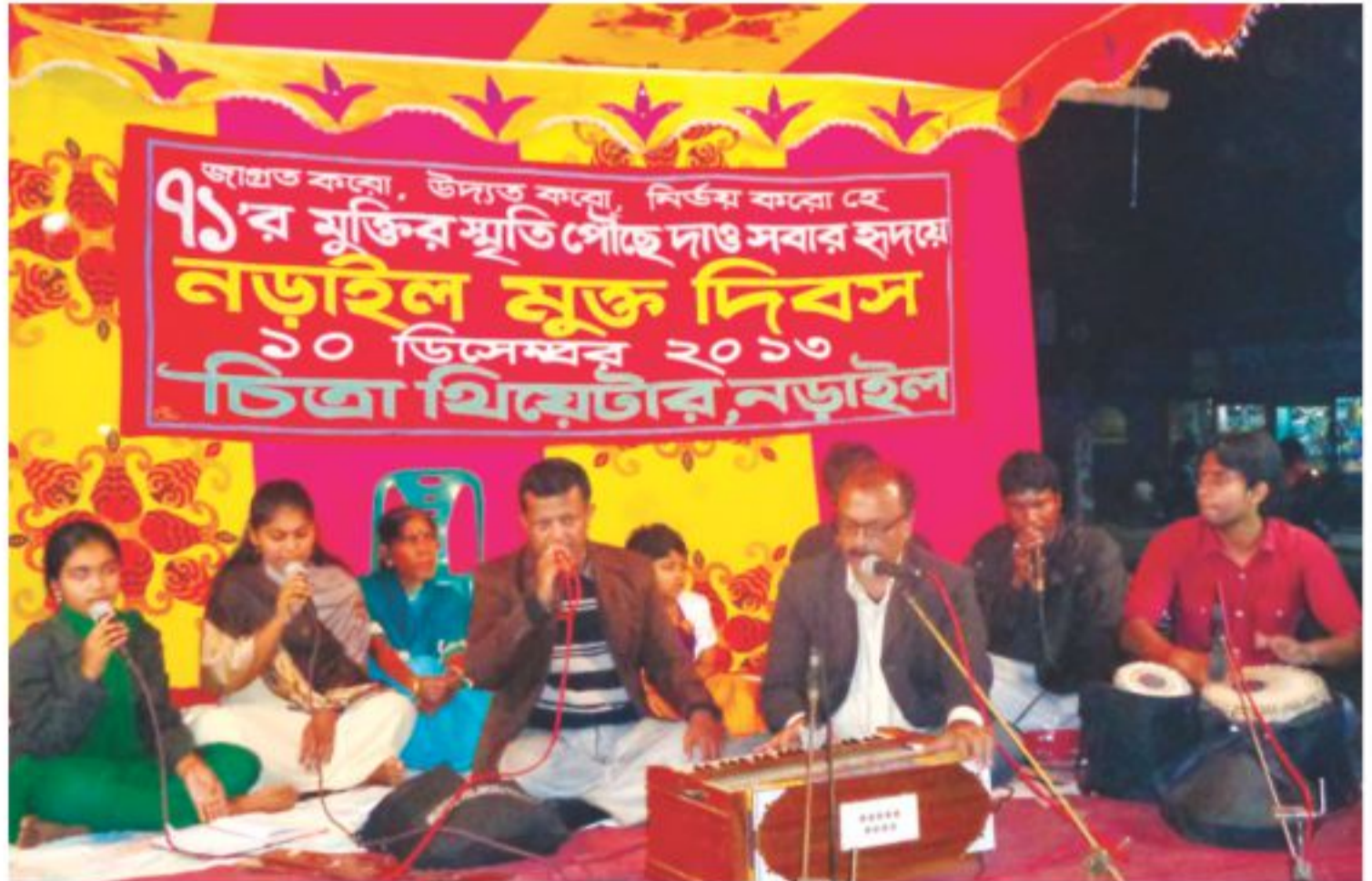
Artistes sing at the programme.

The cultural programme that followed went on till midnight, and entertained the large crowd in attendance.