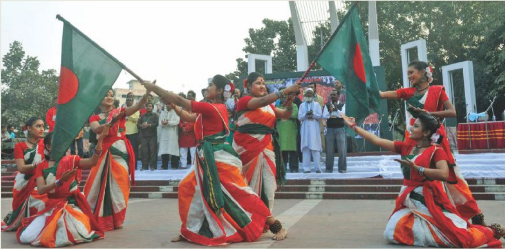
Dancers of Spondon perform at the Shaheed Minar.