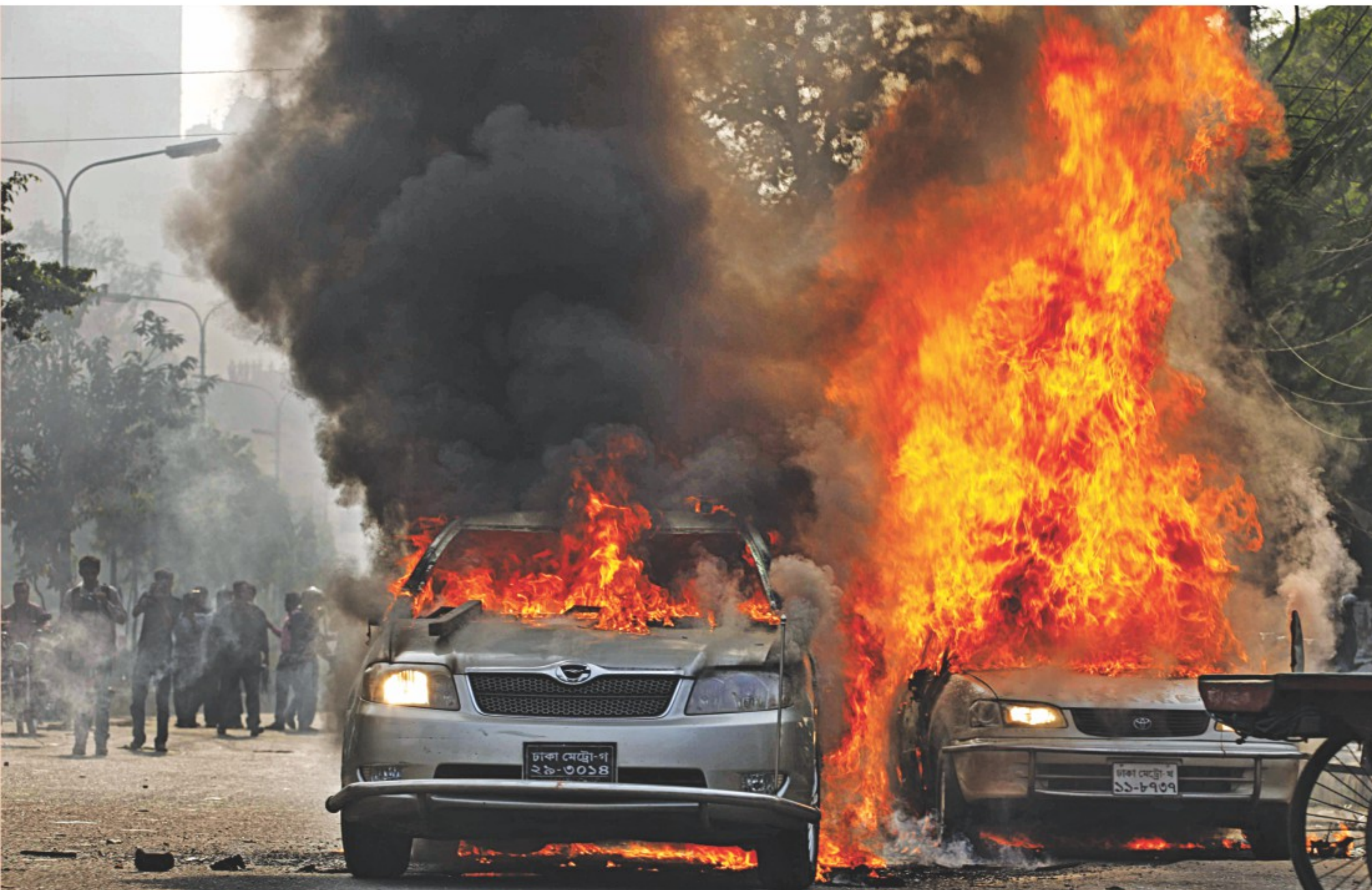
Cars in flames near AGB Colony in the capital after Jamaat-Shibir men, aggrieved by the execution of war criminal Quader Mollah, went wild yesterday and torched several vehicles and roadside shops. More photos on page 2, 5 and 16.