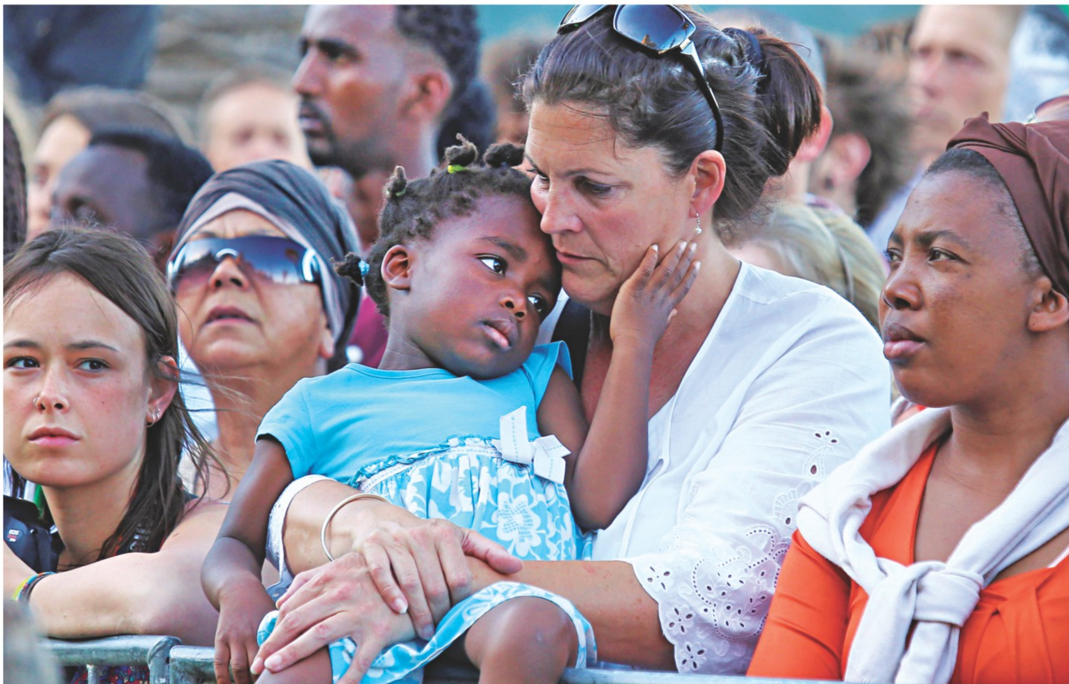
LEGACY OF MANDELA ... Mourners of all races, faiths and age gather on Friday to honour Nelson Mandela in a service at the Grand Parade in Cape Town where the revered icon of the anti-apartheid struggle had made his first speech as a free man in 1990.