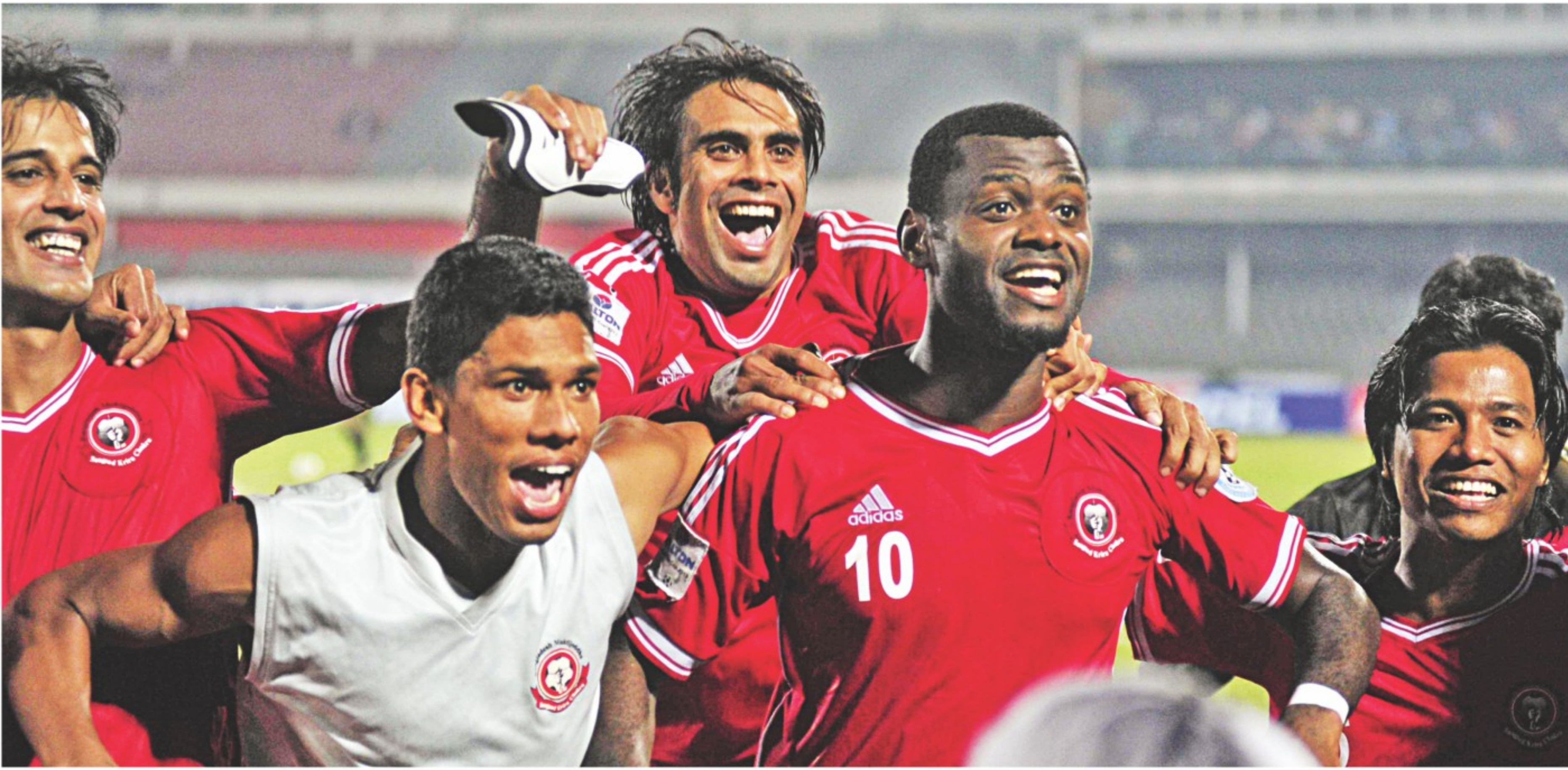
Muktijoddha players erupt with joy after winning 5-3 on penalties against Team BJMC in the second semifinal of the Federation Cup at the Bangabandhu National Stadium yesterday.