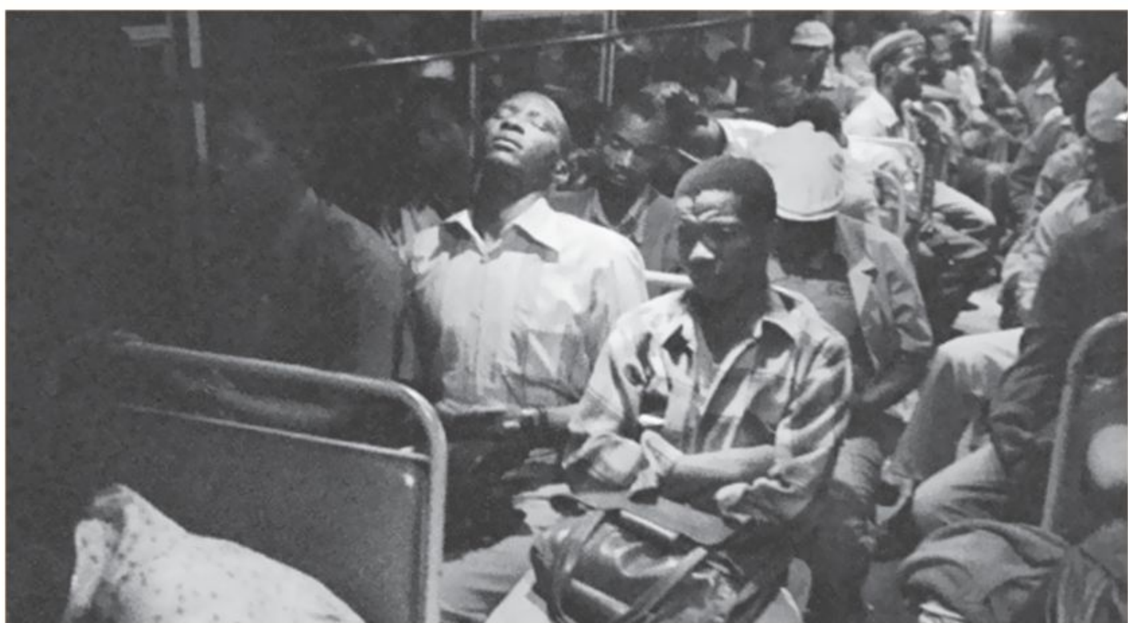
South Africa, 1983: Exhausted workers cram onto a "blacks only" bus traveling from a segregated homeland into Pretoria at two o'clock in the morning.