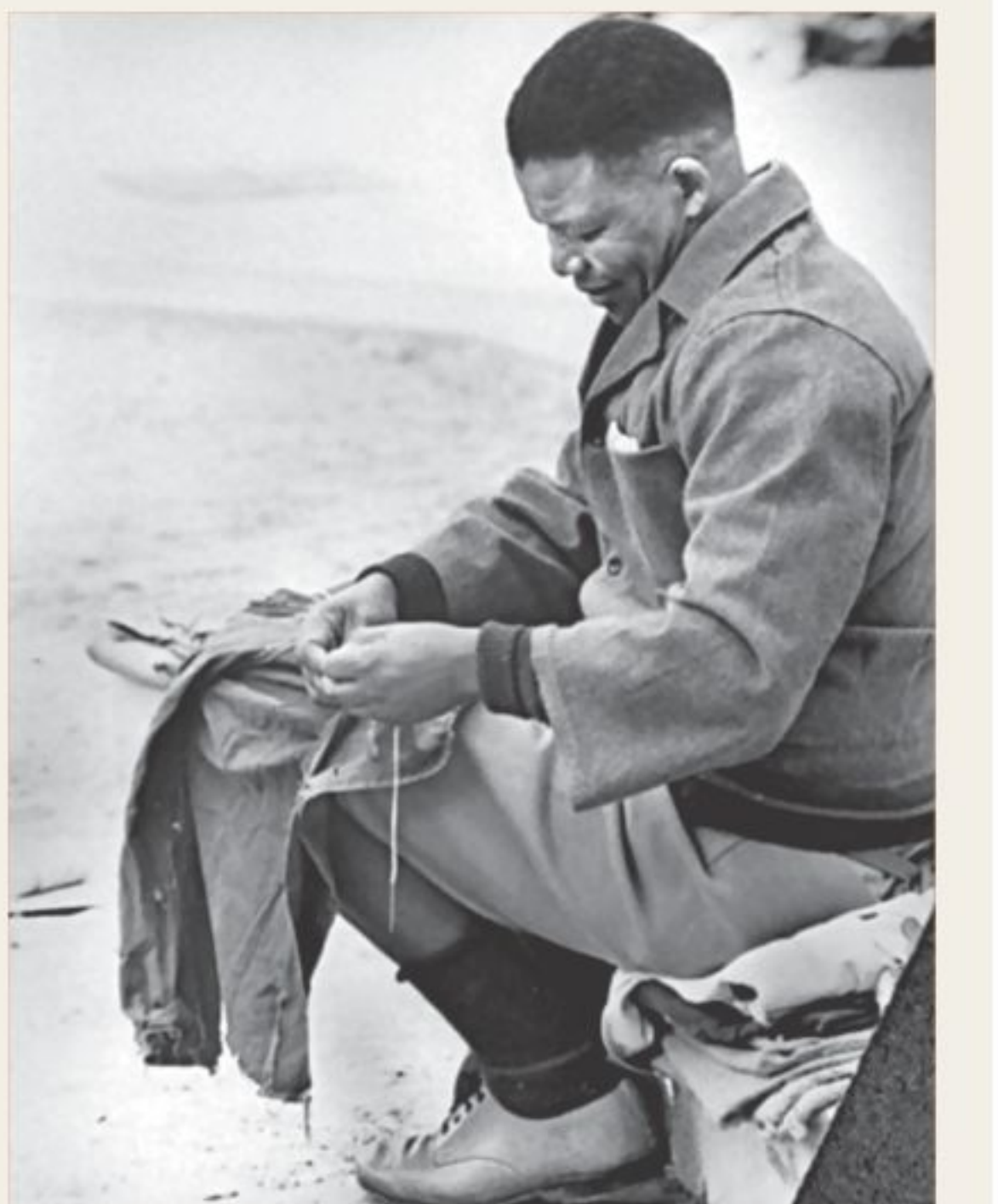
Mandela sews prison clothes in the infamous jail at Robben Island.

On life What counts in life is not the mere fact that we have lived. It is what difference we have made to the lives of others that will determine the significance of the life we lead. On determination Everyone can rise above their circumstances and achieve success if they are dedicated to and passionate about what they do. On the liberation movement Many people in this country have paid the price before me and many will pay the price after me. On prison life In prison, you come face to face with time. There is nothing more terrifying. On friendship I like friends who have independent minds because they tend to make you see problems from all angles. On equality I have never regarded any man as my superior, either in my life outside or inside prison. On ideology I had no specific belief except that our cause was just, was very strong. On leadership Real leaders must be ready to sacrifice all for the freedom of their people. On death Death is something inevitable. When a man has done what he considers to be his duty to his people and his country, he can rest in peace. I believe I have made that effort and that is, therefore, why I will sleep for the eternity.