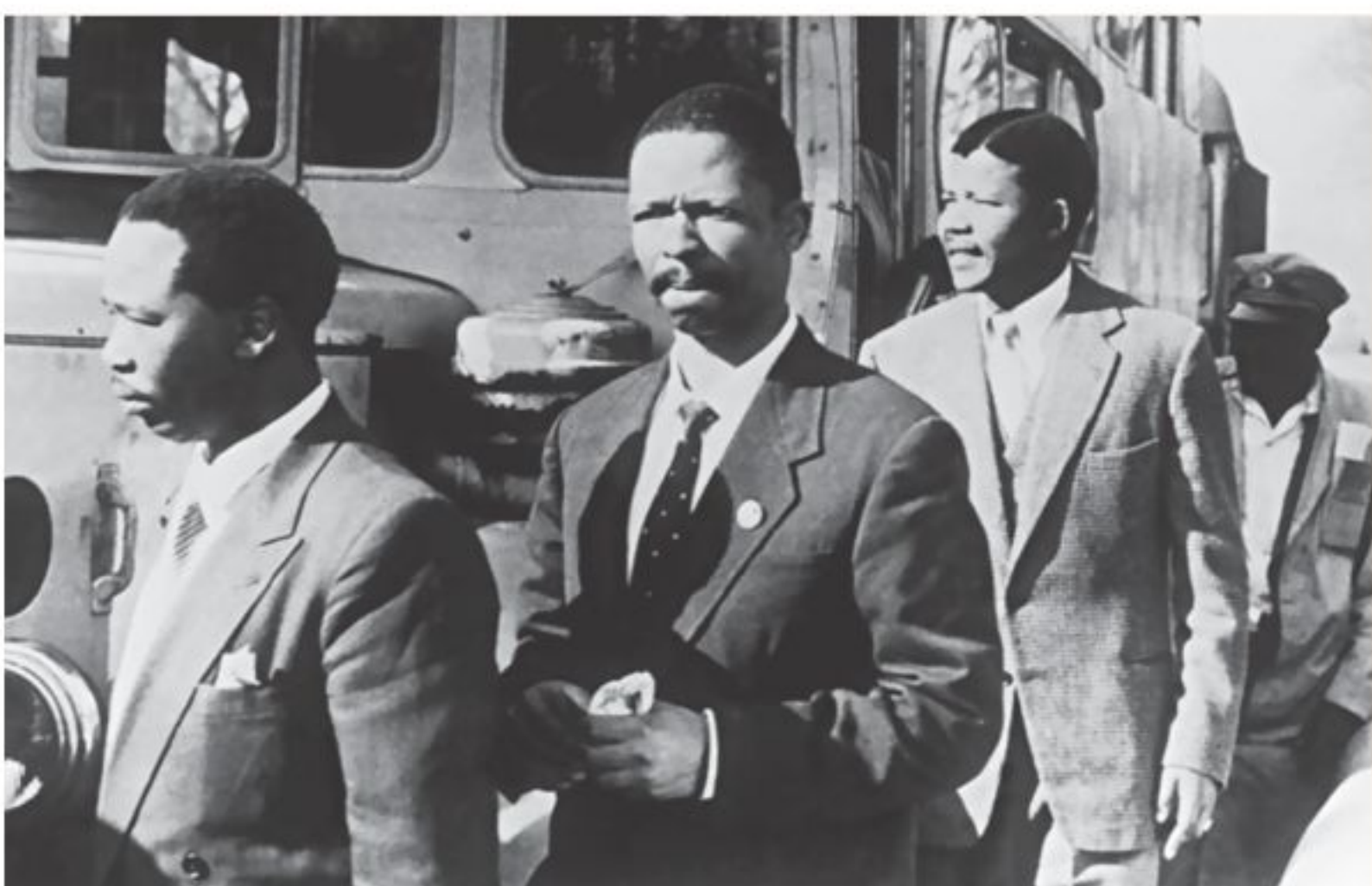
Nelson Mandela, second from right, walks with other militants charged with treason to their trial in 1956.