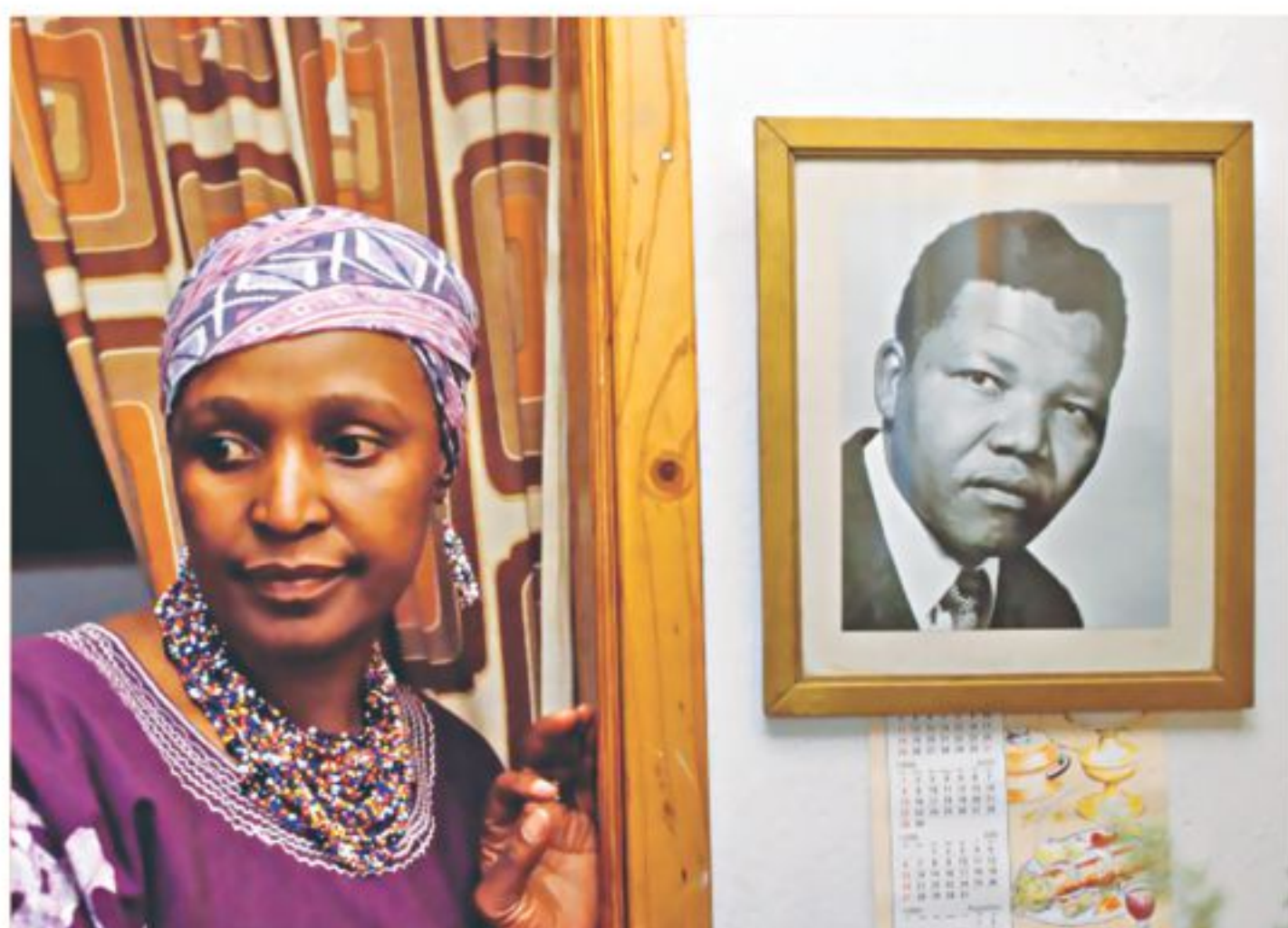
KEEPING HOPE ALIVE: Winnie Mandela stands by a portrait of her then husband in their Soweto home in 1985.