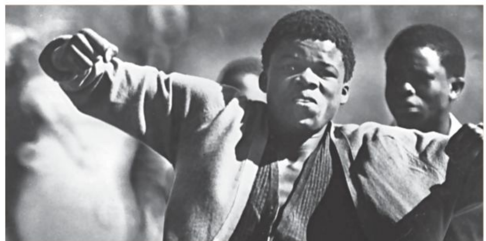
On June 16, 1976, students protested a government mandate requiring the Afrikaans language to be taught alongside English in schools. The uprising spread from Soweto to other towns.

our youth. UNITE ! We face an enemy that is deep rooted, an enemy entrenched and determined not to yield. Our march to freedom is long and difficult. But both within and beyond our borders the prospects of victory grow bright.